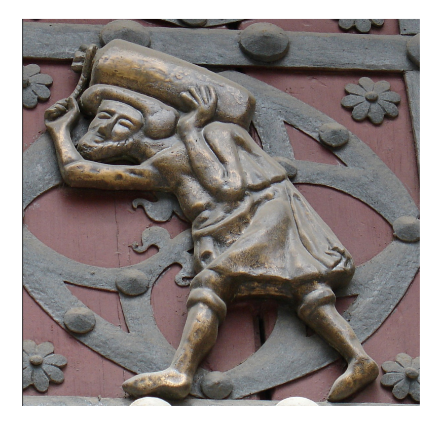
Fig. 5.1. Figure of a dockworker on the main door of the parish church of Santa Maria del Mar. Photo: Xavier Caballé (2006).

Soria Sánchez, Valentín. "Historia de las fiestas de la Inmaculada Concepción en Extremadura." In Francisco Javier Campos y Fernández de Sevilla, coord., La inmaculada Concepción en España: religiosidad, historia y arte, Actas del Symposium, 1–4 September 2005. El Escorial: Ediciones Escurialenses, 2005, 575–592.