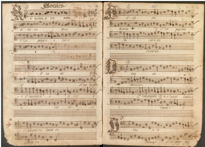
Fig. 3.2. Cristóbal de Morales. Missa pro defunctis for four voices (RISM: P-BRad 965), fols. 34 v –35 r . Braga. Arquivo Distrital, MS 965.