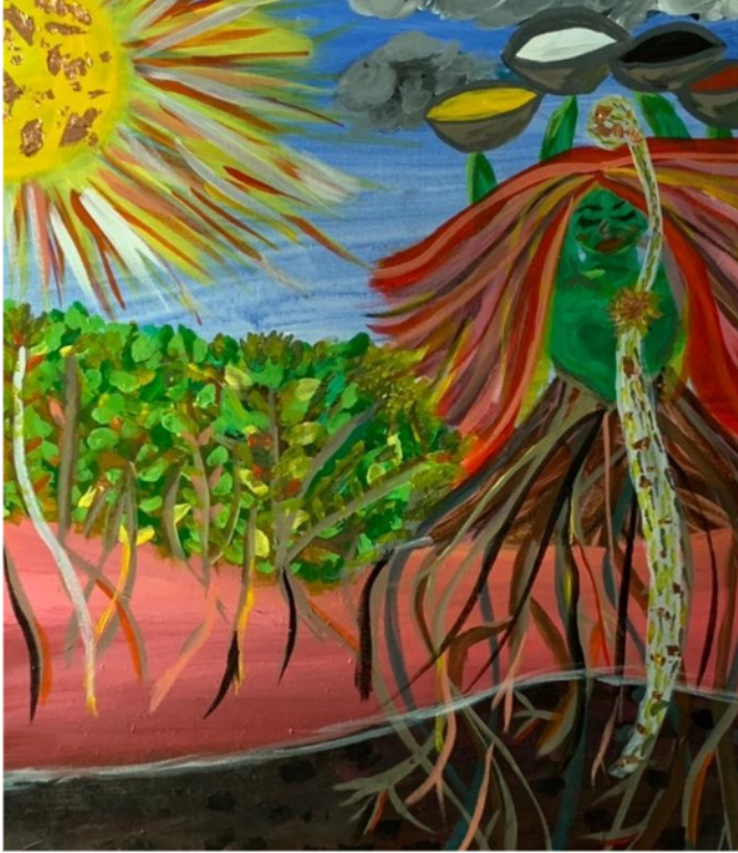
Figure 3. Unattainable Belonging [Painting]

profound transformation in my perspective. I believed that although my childhood was fraught with hardships, I stood at a precipice to speculate a future that is more joyful and meaningful overall. This was a transformative paradigm shift. Cranton (2008) suggested that