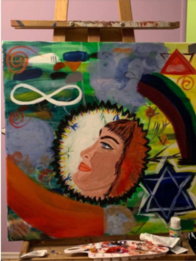
Figure 4. Imagining New Futures [Painting]