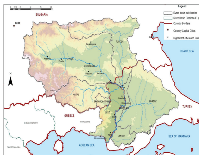
Figure 3. The Evros River Basin and the country borders of Greece, Turkey and Bulgaria.