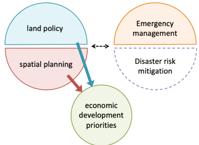
Figure 4. The operation of the Greek land policy system in conjunction with other policy domains. In the case of Evros River Basin the situation pronounces an emphasis given by land policy to agricultural developmental priorities and less to emergency and disaster risk mitigation

Even in the recent attempts towards an integrated approach to flood safety, triggered by the European directive, the preservation and cohesion of agricultural land is thus strongly prioritized and projected as the sine qua non pre-condition of economic development. In other words, land policy does not appear to have any inherent role in the making of a safe and resilient environment. It appears to be supporting mere socio-economic priorities for the local farming communities. In this context, the search for new areas to be designated by the Regional Plan as High Agricultural Productivity Lands assumes overwhelming significance (Article 6) and land consolidations seem like the exclusive means to further enhance agricultural productivity (Article 14). Flood protection remains a separate policy domain in the Regional Plan and flood management provisions consisting of a number of projects (drainage systems, embankments, pumping stations) and especially land levees. Overall, land policy measures implemented throughout the years -and even nowadays- have not been combined to flood risk mitigation but have acted autonomously and as a result have even aggravated the vulnerability conditions of the case study area.