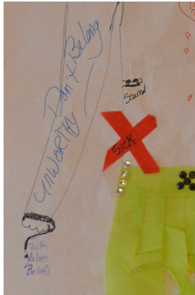
Aurora – Body Map #1

In Figure 2, Aurora’s sense of feeling chained (as wrapped around her hand) connected to an unease about how much her personal sexual ideologies may fit with CSHE instruction. Aurora’s unease stemmed from seeking to reconcile her to-be enacted CSHE pedagogical approach with the multiple, contradictory sources of sex information/education she had experienced. Aurora questioned ideologies that she had embodied, wondering “Are they made up ones? Are they really mine? Are they ones I just grew up with along the lines, or, or have they changed? Am I willing to let them change?”