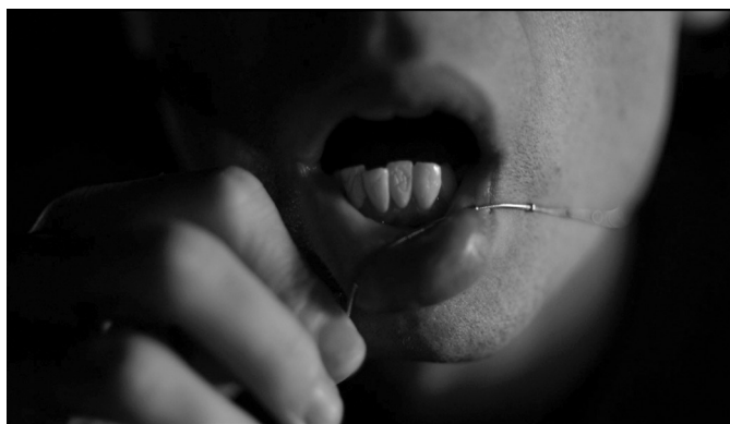
FIGURES 4 AND 5 Engraved teeth and writing a secret message in flesh, from Stefan Maier, Deviant Chain , 2019. Courtesy of the artist.

With these questions in mind, these sonic explorations inspired me to develop episodic videos to contextualize my emerging musical work. Set in an imagined future, the videos depict a world where humans have to grapple with non-human language and inhuman cognition—forms of cognition which may no longer correspond to inherited categories of human comprehension. In one scene, a character receives strange voice messages; in another, a biohacker inserts a magnet covered in inscriptions under her skin. Videos of this imagined future are enriched by portrayals of various moments when human language has undergone irreversible or otherwise remarkable transformations—the movement of the larynx down the throat of Homo Erectus over a million years, the first inscriptions of abstract symbols on a necklace of teeth during the upper paleolithic, among others. Drawing on deep-time genealogies of hominid language acquisition and capacity for symbolic abstraction, my goal is to show how the unexpected situation this imagined future portrays is, strictly speaking, not without precedence. Finally, the output of Inference is used as the basis for an imagined language: the phonetic material generated by the AI is used to construct a new phonology and alphabet specific to its garbled output.