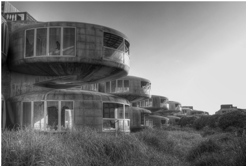
FIGURE 1 Sanzhi Pod City, circa 2008.

Construction of the Sanzhi Pod City, near New Taipei City, Taiwan, began in 1978. Originally planned as a utopian vacation retreat for US soldiers stationed in the South Pacific, the futuristic pod-like structures would never be completed [...] the project was abandoned in 1980. However, when demolition work began some 30 years later, it was discovered that where human construction had ended, not 1, but 5 hitherto unknown species of Orchid Mantises had speciated and multiplied to an estimated population of over 10 million insect inhabitants. Research revealed that the Mantis civilization, which developed inside, between and beneath the Pods, displayed highly unique behaviors [...] The Future [...] is not for us. The Anthropocene, the reframing of the Earth in the image of industrial modernity, will be short lived. It will be less of a geologic era than a geopolitical instant. Humans are already vanishing, even despite our growing aggregate biomass. Our cities are not our own. We are building habitats for other life forms. We are the tools wielded by these other forms. 1