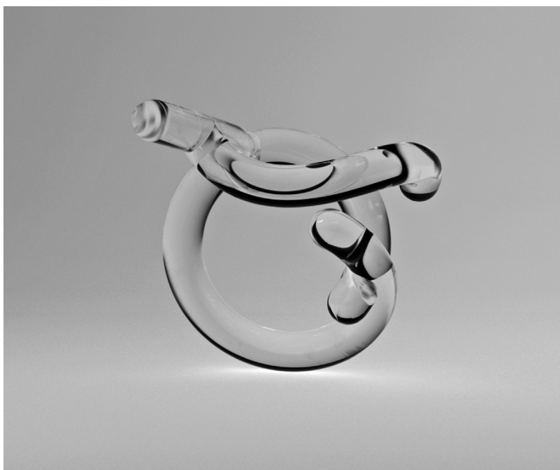
FIGURE 6 A character from Inference's machine alphabet, from Stefan Maier, Inference , 2021. Courtesy of the artist.

computer-controlled light and sound spatialization directed a mobile audience through a complex, non-linear interplay of synthetic language, abstract sound, and fragmentary exposition. The work premiered at the Ultima festival in 2019.