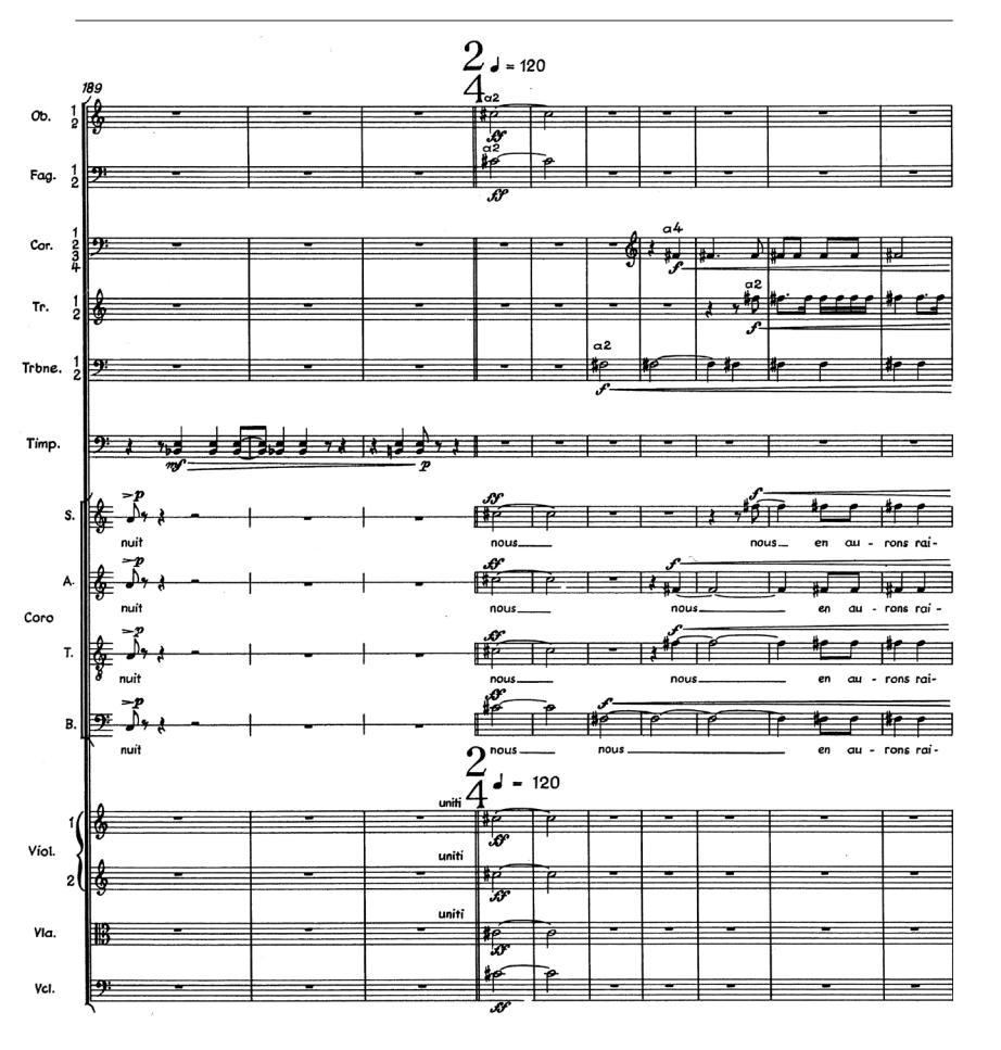
FIGURE 1 La victoire de Guernica by Luigi Nono (mm. 189-198). The brass section performs a rhythmic canon based on L'Internationale . © Ars-Viva-Verlag, Mainz. By kind permission of Schott Music, Mainz–Germany.

Several acclaimed composers, not analyzed here, have produced works relating to the bombing of Guernica, often through the interpretative prism of artworks such as Pablo Picasso's painting Guernica (1937) or Paul Eluard's poem La victoire de Guernica (1938).<sup>7</sup> The first documented instance was Paul Dessau's Guernica (1937)<sup>8</sup> and Stefan Wolpe's Battle Piece (1947), although not a confirmed case, also supports this hypothesis.<sup>9</sup> La victoire de Guernica (1954) by Luigi Nono, which incorporated Eluard's poem, is further evidence. Nono fully embraced Eluards's Marxist interpretation of the war crime, as evident in his musical quotations of L'Internationale and Ernst Busch's Mamita mia .<sup>10</sup>