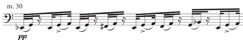
FIGURE 7 Géométrie sentimentale , ii, m. 30 (violoncello).

At its reappearance in measure 42, the orange robot wears a new harmonic mask: the chromatic cluster mask. This robot retains its transitional function, nervous sense of steady forward motion and sparkling quality—this time in the flute, oboe and clarinet—but is now comprised of pitches forming a slowly moving cluster. Bernstein has pointed out the influence of Serbian folk music on Sokolović's use of dissonant major and minor seconds in her vocal music. 20 This influence extends to Géométrie sentimentale , with the