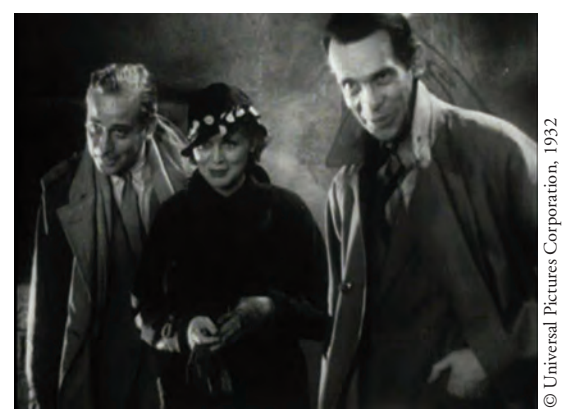
Fig. 1. The Old Dark House (James Whale, 1932). Grouped figures bow...