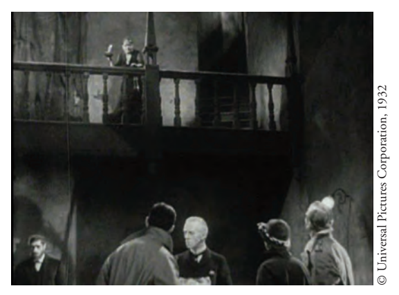
Fig. 10. Shot 1.