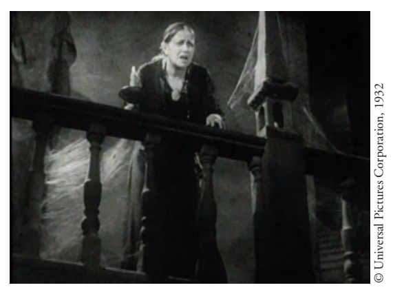
Fig. 11. Shot 2. "What is it? What do they want?"