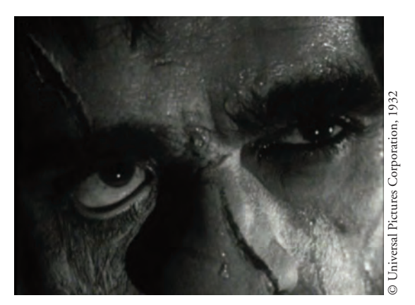
Fig. 17. Shot 1.

This spatial hiccup is mild, but placing it beside other moments in the film can help us make a case for a cumulative effect. Whale takes one space, a landing, and effectively multiplies it by two. Elsewhere he splinters spaces into fragments in ways that do not conform to standard classical Hollywood editing practices. For example, when Morgan is chasing Margaret, Whale cuts to two extreme close-ups of his face (Figs 17-18). Whale is ready to manipulate time in unorthodox ways as well. One such occasion, I suggest, begins when Saul first lays his hand on the banister (see Fig. 4). It stays there unmoving for so long that most viewers, I suspect, forget about him. Then,