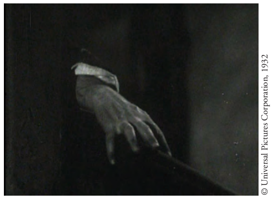
Fig. 4. The second shot of Saul's hand on the banister.