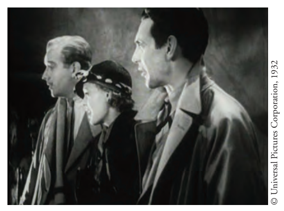
Fig. 2. ...implore...