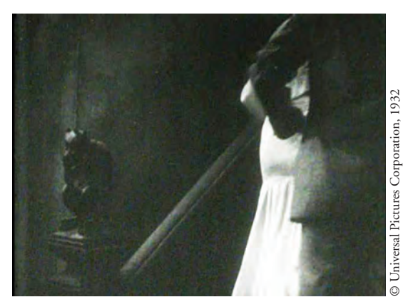
Fig. 15. Shot 1. When the characters ascend from one landing...

viewers and characters losing their way in this space as well. A map of the house that is always reliable is less fun than one that can lead to dead ends, puddles and worse places. Whale supplies a map when Horace tells Philip that he'll find the lamp on the little table on the landing two floors above. Later, he takes this map away when Philip and Margaret pass by a gargoyle on one landing (Fig. 15) then, after a cut, ascend to the next landing, where a second gargoyle creates a graphic match with the first which makes the edit look like a jump cut (Fig. 16)—as though the characters have not proceeded to the next level at all but come back to the same one. As in a nightmare, or a house of