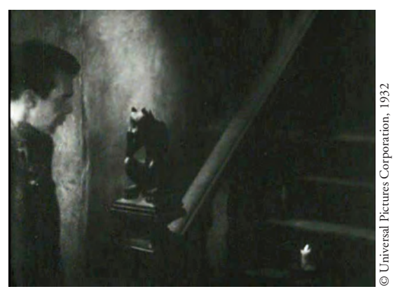
Fig. 16. Shot 2. ... and arrive at the next, the second gargoyle takes the place of the one below.