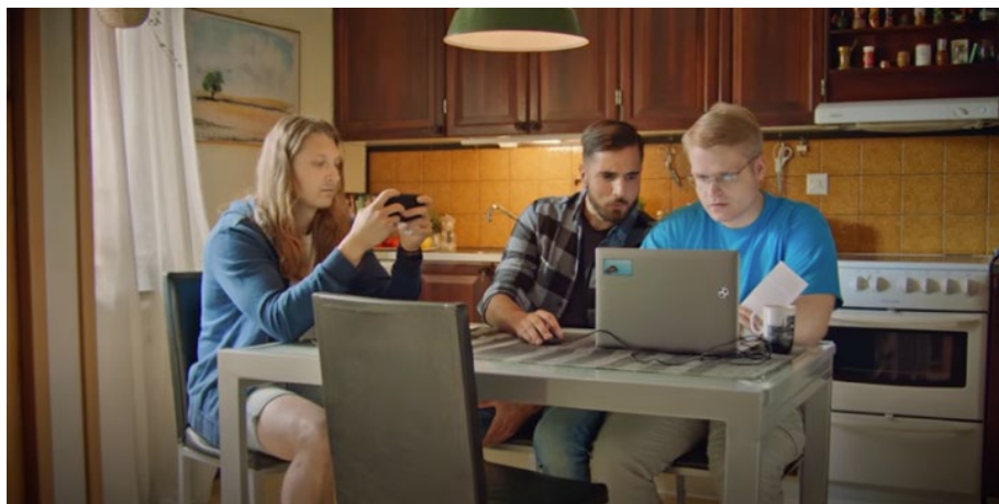
Figure 9. Cabin Upgrade Made Possible by Winnings (2021-22)

Here, the participants are all male including the voiceover which is recognizable as Ture. The constructed audience address is thus solely communicating male identities, activities and bonding. The slightly dated kitchen design and simple kitchen furniture, along with the lads’ casual looks and clothing, connote a working/middle-class, rural context where it may still be (stereotypically) cool to book a Finland ferry trip, an activity which may simultaneously be considered distinctly unhip by an urban, contemporary, young audience. Although no longer focusing on cozy cottage life, Casinostugan continues to primarily situate its participants away from urban, stressful living, and place them in the more slow-paced life in the country. The brand also continues to emphasize moderate winnings (enough to upgrade the cabins) rather than luring audiences by constructing Big Win scenarios.