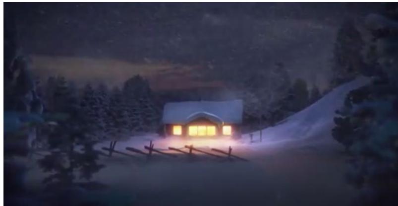
Figure 4-5. Winter and Christmas Time in the Casino Cottage (2014)

in hoof, connects with the viewer by announcing, lucky there is both warmth and excitement in Casinostugan . A shot of the hearth and lit candles in the cozy cottage is shown before Ture repeats the same bonus offer from the previous ad and the slogan for us who want to win in peace and quiet ahead of the round-off logotype (Figures 4-5).