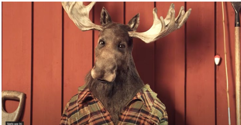
Figure 7. Ture The Moose (2015)

When looking closely at the communicative achievements of having a moose as the main character in this online casino ad campaign, a multifold of purposes can be discerned. From the production point of view, an actor in a moose costume was not only much more cost-effective than an expensive celebrity, but stood out from the crowd when it came to existing personalities in gambling ads, according to Stefan Leijon. The moose as a symbol for casino gambling is not exclusive to the Swedish Ture and Casinostugan but is used as a symbol for other casino venues such as The Crazy Moose Casino Mountlake Terrace in Washington, USA, and in the name as in Casino Moose Jaw in Canada. There are also casino games such as the video slot game Moose Vamoose which features an animated goofy-looking moose accompanied by atmospheric banjo music.