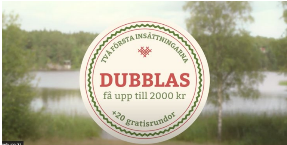
Figure 3. Displaying bonus opportunities in a homey way (2014)

A similar narrative is presented in the ad's winter versions, Into the warmth and Welcome inside the Christmas cottage launched a few months later (November and December 2014, respectively). The cottage and its surroundings are now clad in snow while frosty winds can be heard sweeping around it at nighttime. But, inside there is a warm fire going, and Ture, dressed in a warm sweater on top of his shirt, iPad