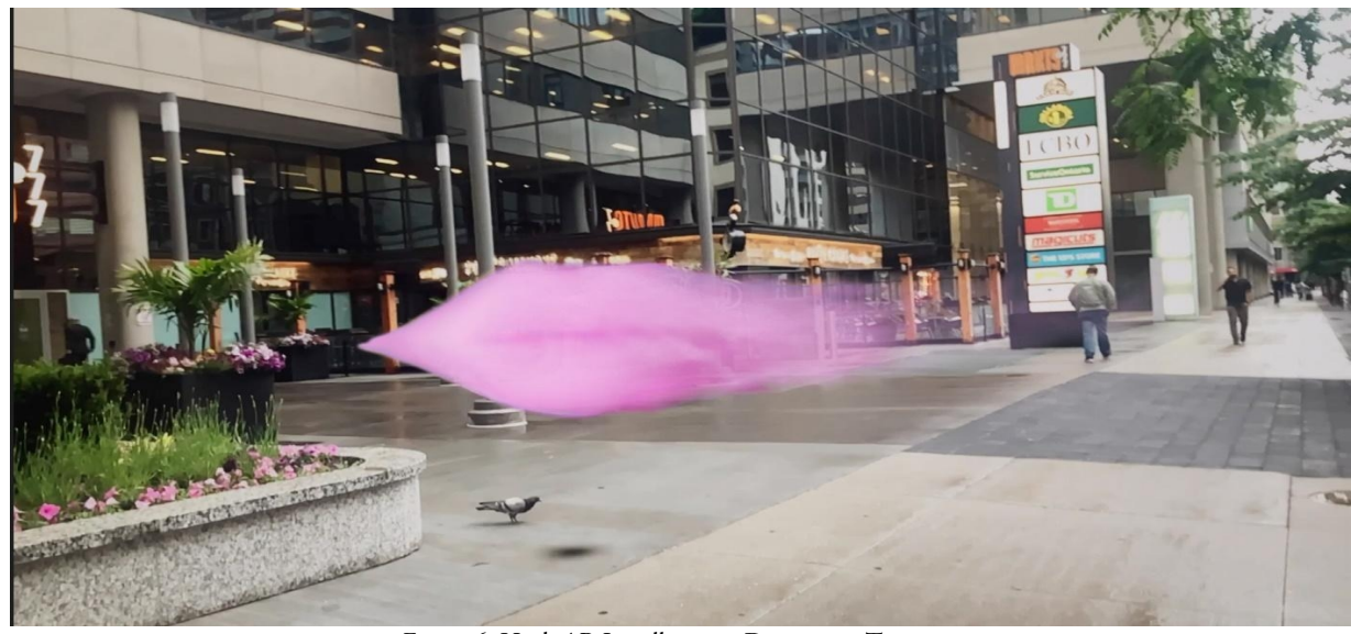
Figure 6: Hush AR Installation—Downtown Toronto