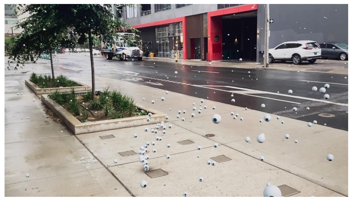
Figure 3: Under Their Eyes AR Installation—Downtown Toronto

On November 18<sup>th</sup>, 2023, we invited participants to experience the Augmented Reality (AR) installation as a walk-and-talk activation in downtown Toronto. Participants had the opportunity to share and reflect on similar lived-experiences, events, and frictions they endured on digital spaces. The route of the installations was (poetically) selected to be in front of the Meta, LinkedIn, and Twitter/X headquarters to assert fem(me)inist digital agency and resistance.