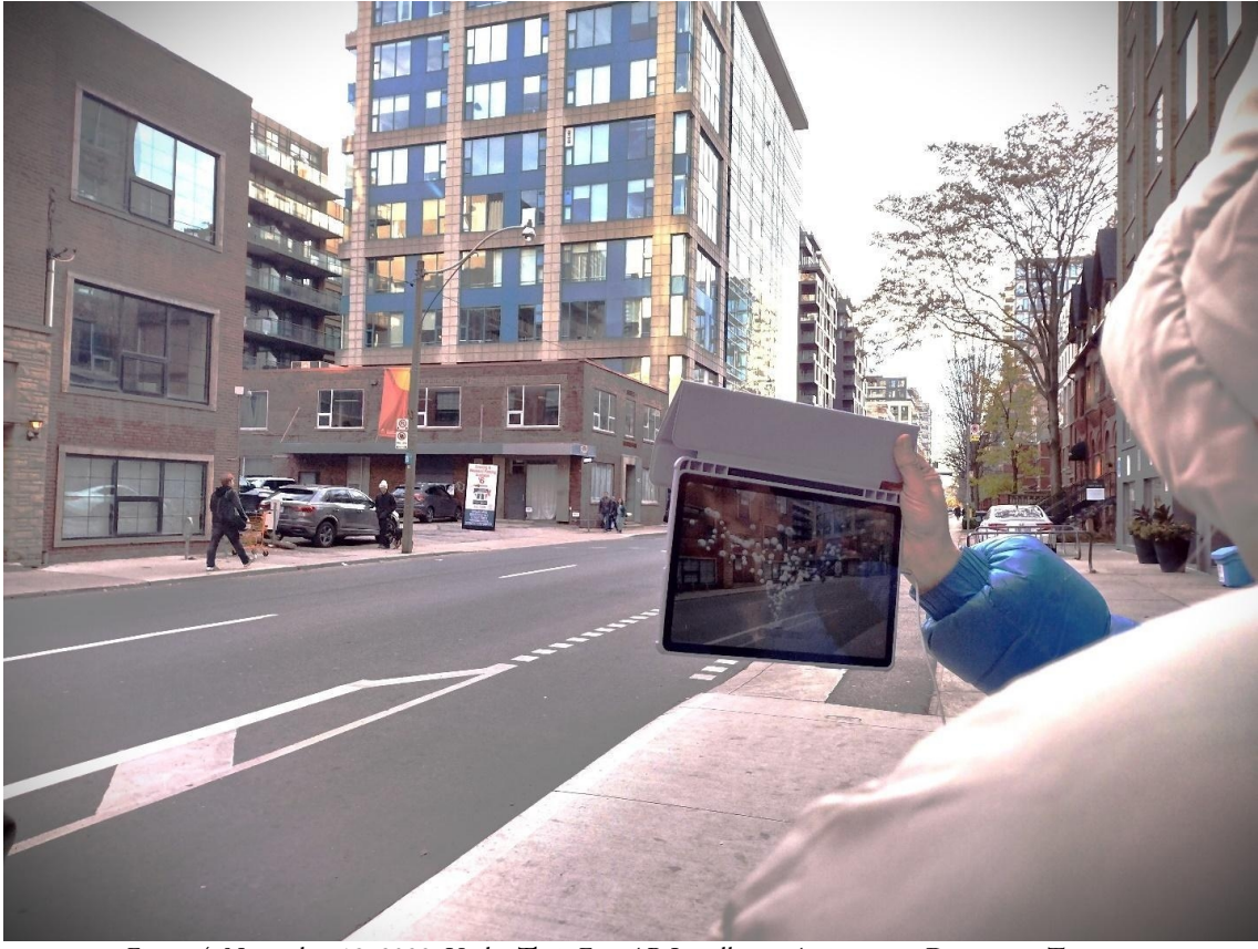
Figure 4: November 18, 2023, Under Their Eyes AR Installation Activation—Downtown Toronto

I'm so tired of the constant cringe of watching others, of the lingering anxiety of being seen. What used to be a pleasurable act, of showing up and curating my online presence, feeling really connected to people, friends, colleagues, became an inescapable subscription to the relentless digital gaze. Now I am surrounded by invisible eyeballs that follow my every move, that reject or approve my actions, urging me to engage, consume, subscribe, be relevant, participate. Hungry eyeballs that keep demanding I'll perform for them. I am tired of dancing to the tune of invisible audiences. I am so tired of the digital gaze, the gaze I can't escape. The gaze that devours me and is always hungry for more. I have nothing left to give the gaze. All I can do is gaze back.