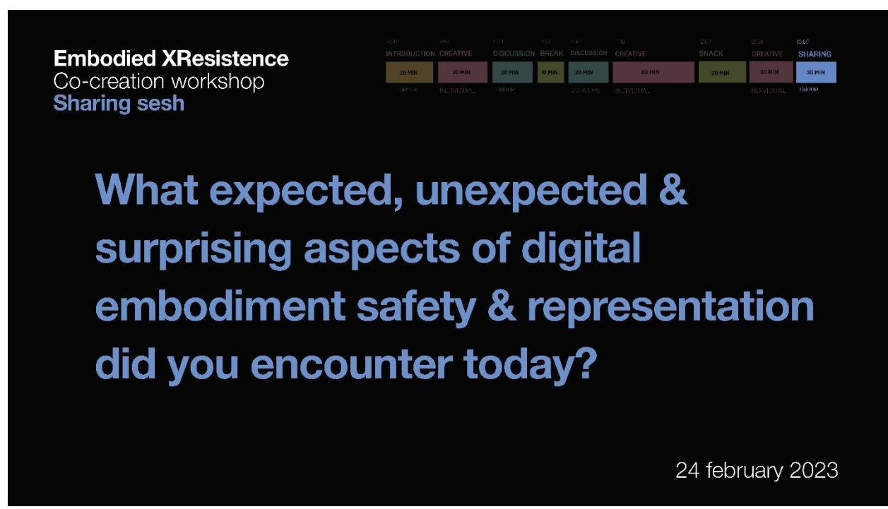
Figure 2: Sharing Sesh—Workshop Slide Deck

A key component of the workshop was the co-creation of artistic responses to the following prompts: 1) What does it feel like to be a female, non-binary, nongender, cisgender, etc. body in a digital space? OR 2) Show us what it feels like to be a female, non-binary, nongender, cisgender, etc. body in a digital space? In person participants used the "analog" crafting supplies (magazines, paints, glitter, fabrics, etc.) that were made available to collage or otherwise create responses to their experiences and our discussion, whereas on-line participants used digital collaging tools such as Canva.