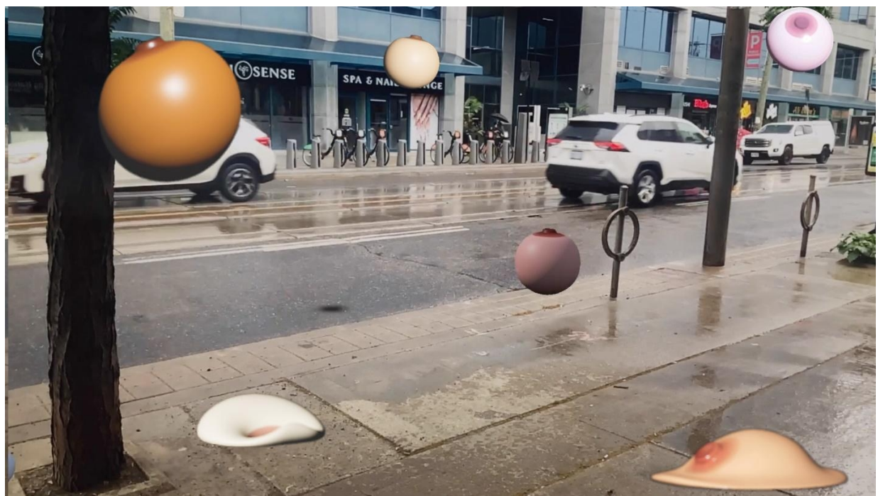
Figure 5: Possessed AR Installation—Downtown Toronto

My body doesn't feel my own online. It is everyone else's to comment on, mock, and objectify. Being harassed in real life is bad, but online, I have no control—it's just so easy, so mundane, so frequent, so immediate, one click—and you're harassed. Your digital body is just 'there' as an open invite to be advanced on, commented on, digitally grabbed, edited and pinched. Where are these body freedoms that digital space promised us? Or was it the freedom to abuse others' bodies they were talking about?