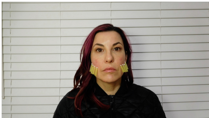
Image 2: Beauty Kink: A Meditation on the Obscenity of the Inevitability of Death , 2021 (video still, 1:00 min).