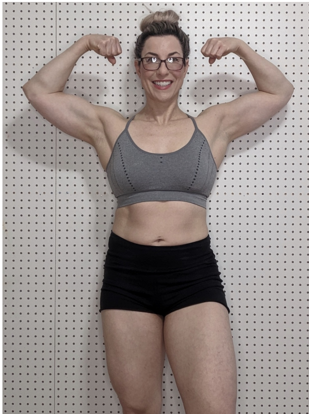
Image 5: After Successfully Gaining 14.5 Pounds, 2023 (digital photograph, dimensions variable).