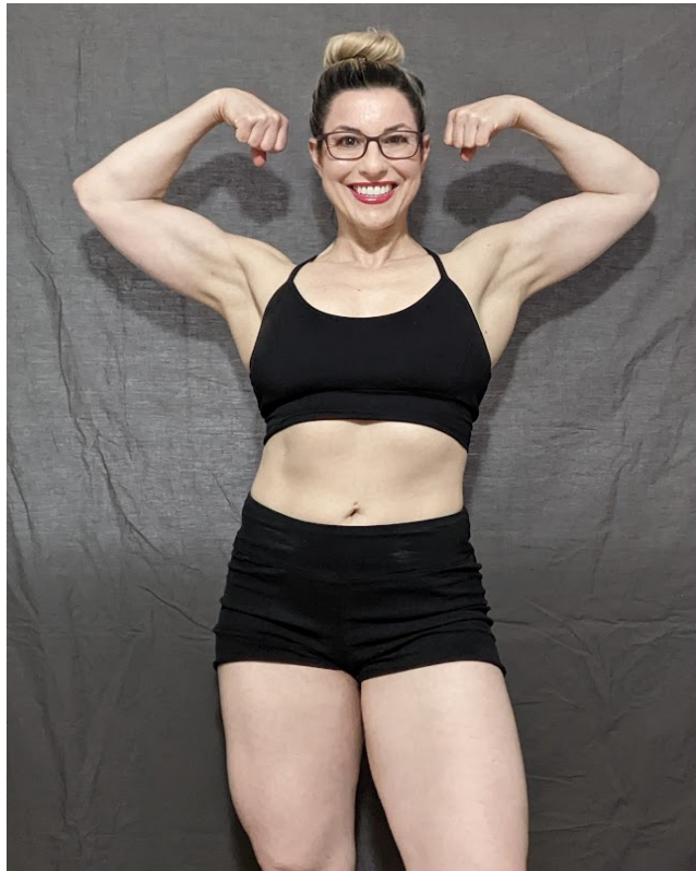
Image 4: Before Successfully Gaining 14.5 Pounds, 2022 (digital photograph, dimensions variable).