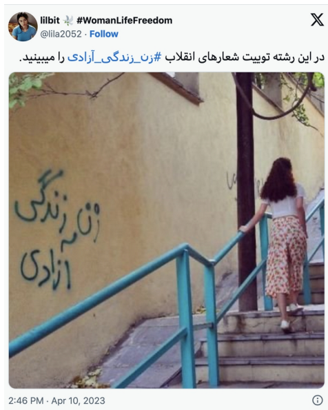
Figure 11. † Women, public space, and daily life. The writing on the wall reads: “Woman, Life, Freedom.”

In the words of W. E. B. Du Bois, a strike is “a wide basis against the conditions of work,” and the feminist strike in Iran showcases its all-encompassing basis against the conditions of living and the restrictions on freedom (1976, 67). In this light, the resounding slogan of “Jin, Jiyan, Azadi” acquires its profound significance, encapsulating the essence of their struggle.