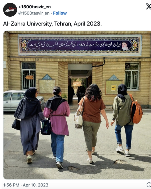
Figure 8. † Several university students entering Al Zahra University without mandatory hijab, Tehran, April 2023.