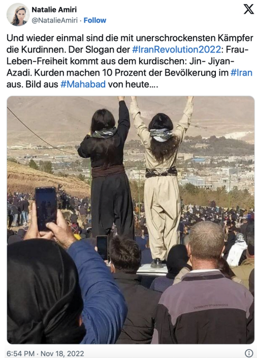
Figure 4. † Two Kurdish girls, dressed in their chosen ethnic attire, symbolizing “Woman, Life, Freedom” in the protest in the city of Mahabad, on November 18, 2022.