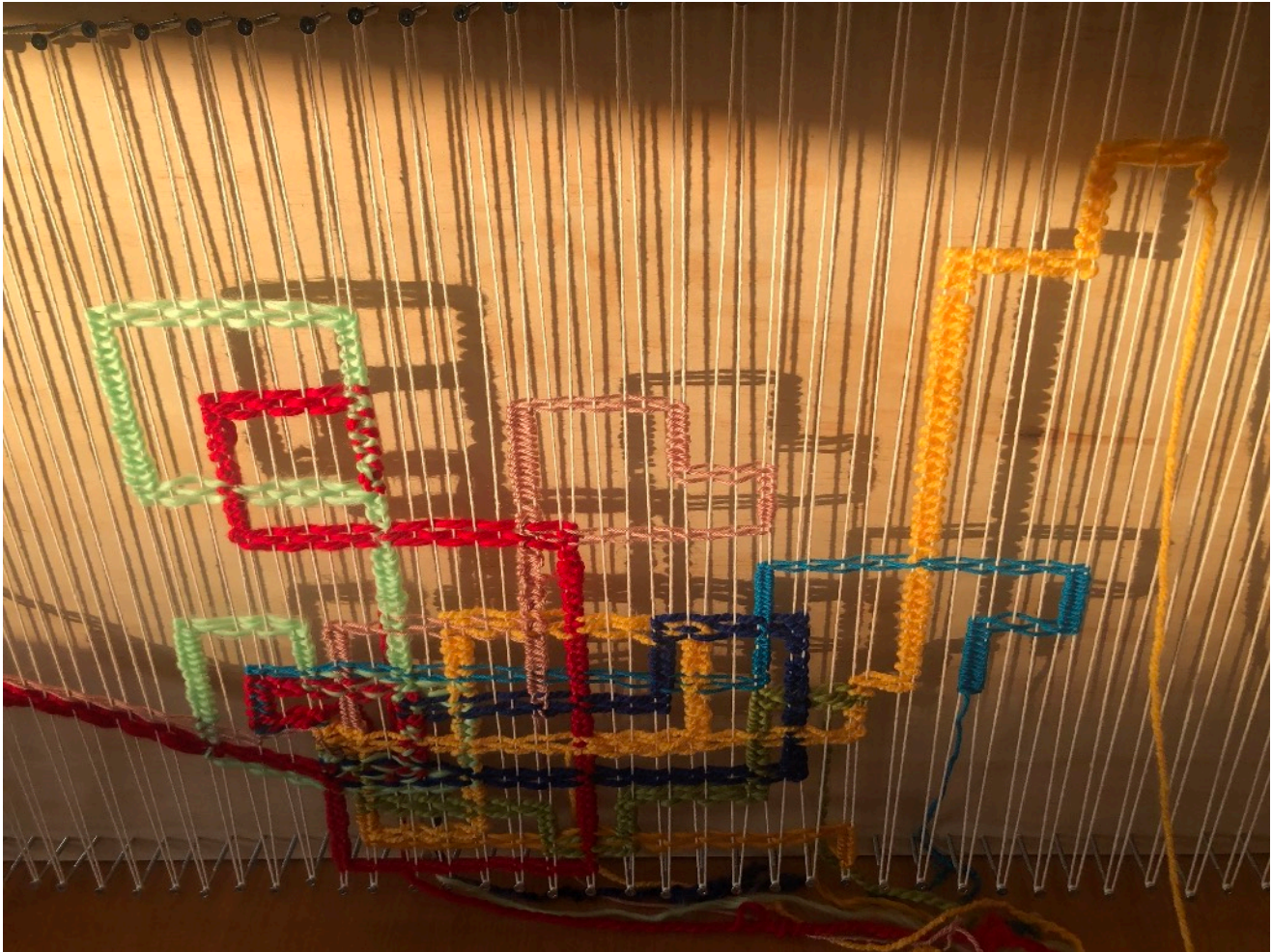
Figure 1 Awareness and the Speculative Middle

I have never eaten a mango. Today will be the day.