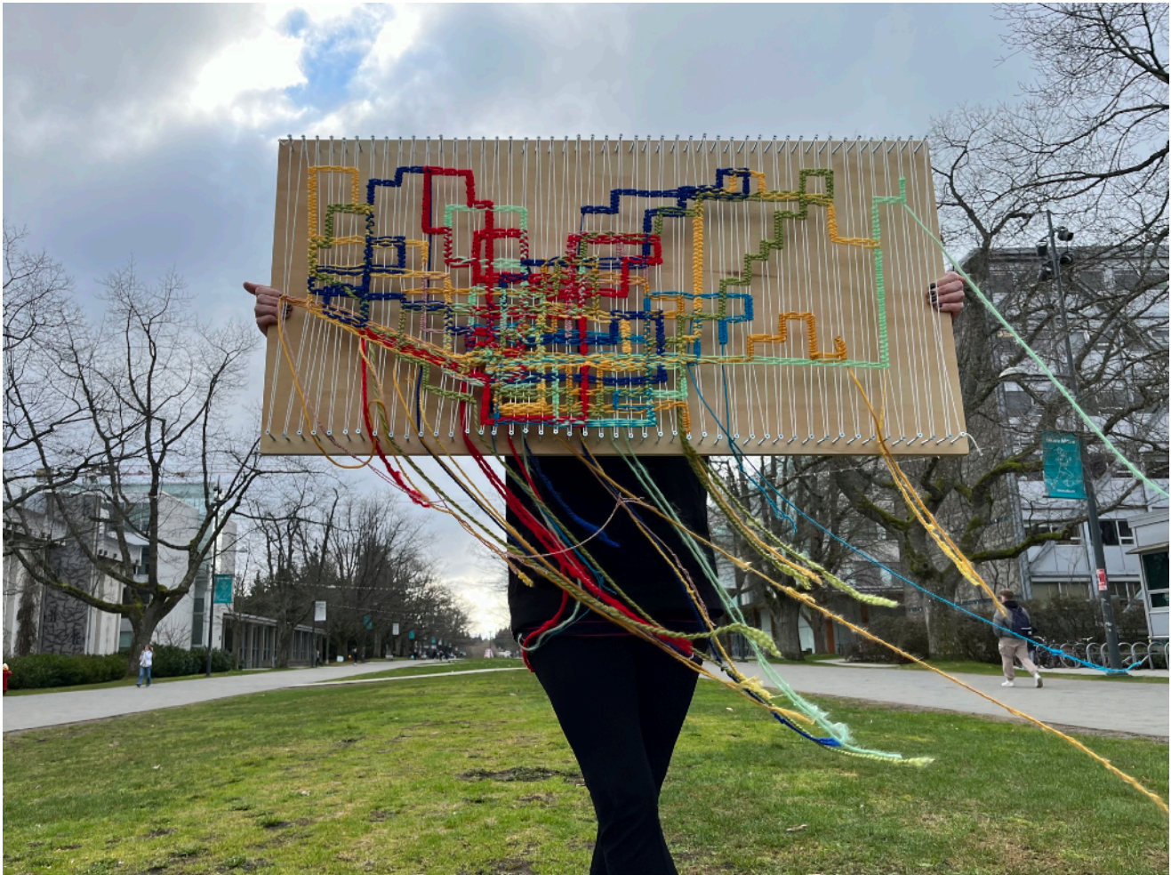
Figure 5 Continuations

Rather than end this paper with a conclusion, I mark the passage of time with a pause. I will likely not continue with this particular iteration of walking-writing-weaving for much longer. But as long as it is paused rather than concluded, I leave openings for new insights, further reconsiderations of the human-algorithm relationship, and possibilities for subjective reconstitution.