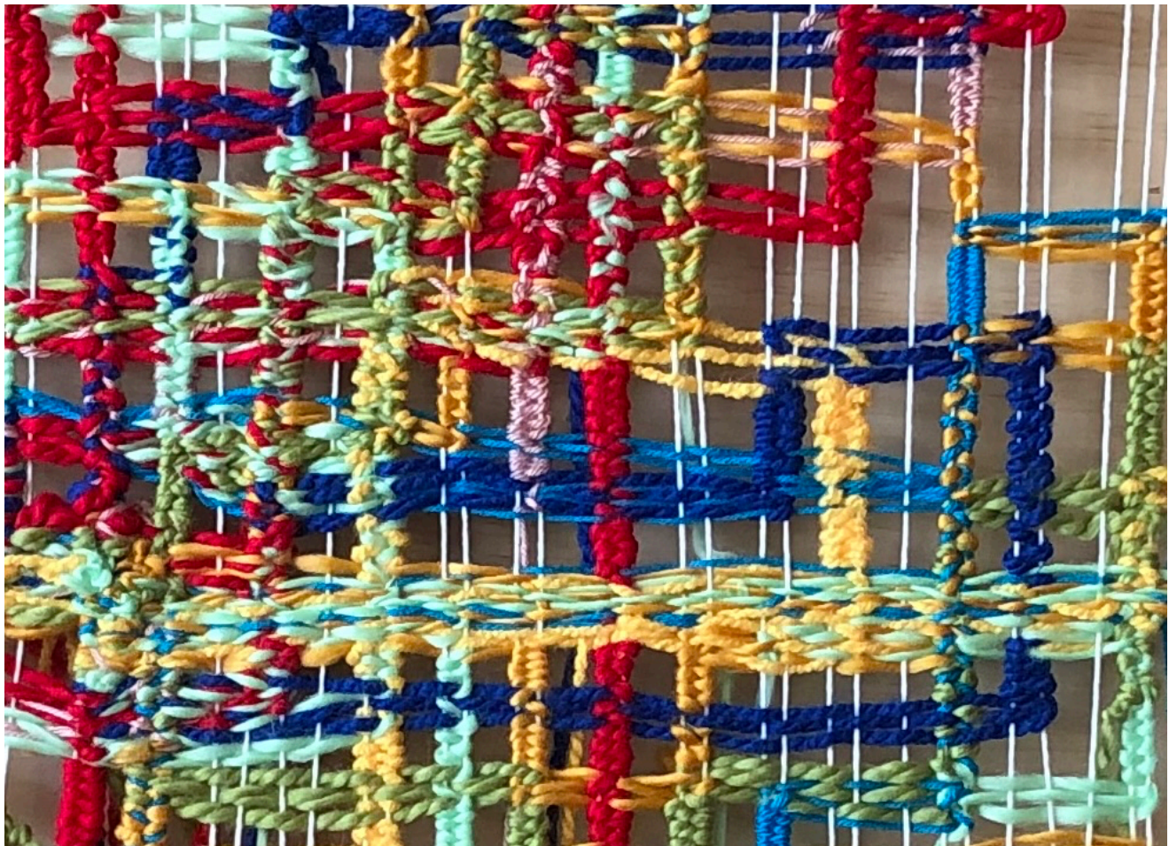
Figure 3 Entanglements

What if the concrete and pavement of the city I walk through disappeared? What if the bare earth remained? What if I walked there, with no signposts or stoplights or sidewalks? What if I walked on the grass and the dirt and the roots of the trees in the time of the yellow leaves?