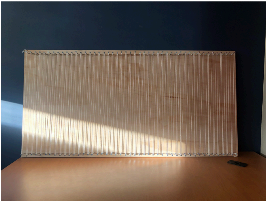
Figure 4 Openings

Over the last few months, people have asked me to tell them about the a/r/tographic inquiry project described in this paper. Most of these conversations inevitably conclude with the person I'm speaking to telling me how much they are looking forward to seeing what the weaving looks like when it is finished. I've been repeatedly baffled by this response. At first, I thought maybe I was doing something wrong. Why would they think it would ever be finished? Did they miss the point? Do they not understand that our relationships with algorithms will never end, and neither will the imperative to reconsider these relationships? Over time I began to realize that the reaction I have been encountering is the reason for a/r/tography. To disrupt this instrumentalist and deterministic focus, we must constantly reconceive ourselves as researchers, teachers, and artists, in whatever form that may take in each of our lives. Our journeys of self-formation and discovery, and of ongoing reconsideration of our relationships with ourselves, each other, and the truth, should never end, yet our traditional research practices often frame life as if it can be tied up and concluded in a neat little easily digestible package. As a method of countering algorithmic efforts to determine our being and becoming, a/r/tographic inquiry can help us live with complexities and contradictions while hanging on to the parts of ourselves that remain resistant to domination.