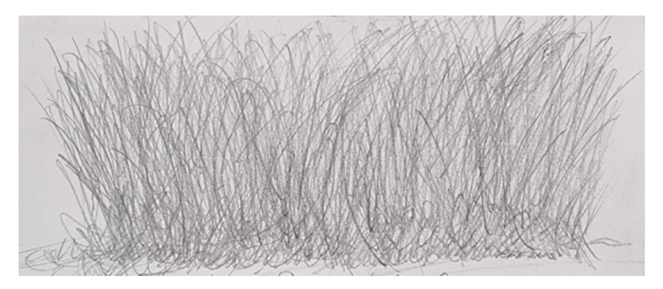
Note: Faleolo (29th June 2023).