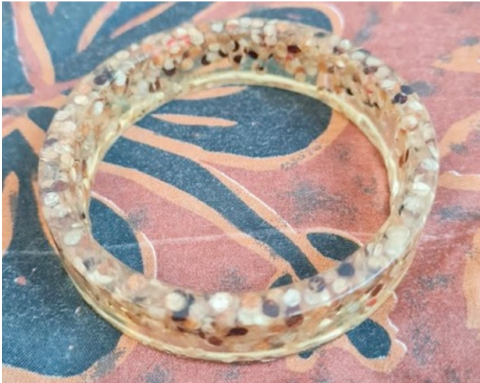
Figure 4 Bracelet

Note: A bracelet made by Fire Fonua using the clippings of the jewellery making process, so as to not waste anything—this has been named koloa confetti