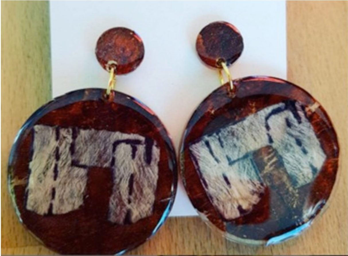
Figure 5 Earrings

Note: Earrings made by Fire Fonua, depicting the Ha'amonga a Maui in tapa on a ngatu background.