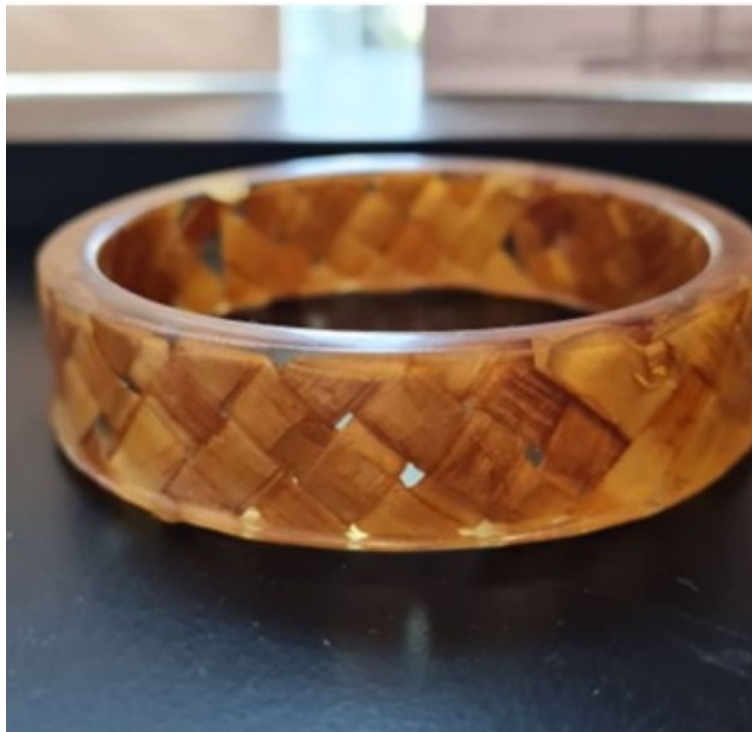
Figure 2 Bracelet