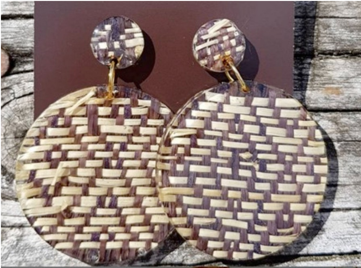
Figure 1 Earrings