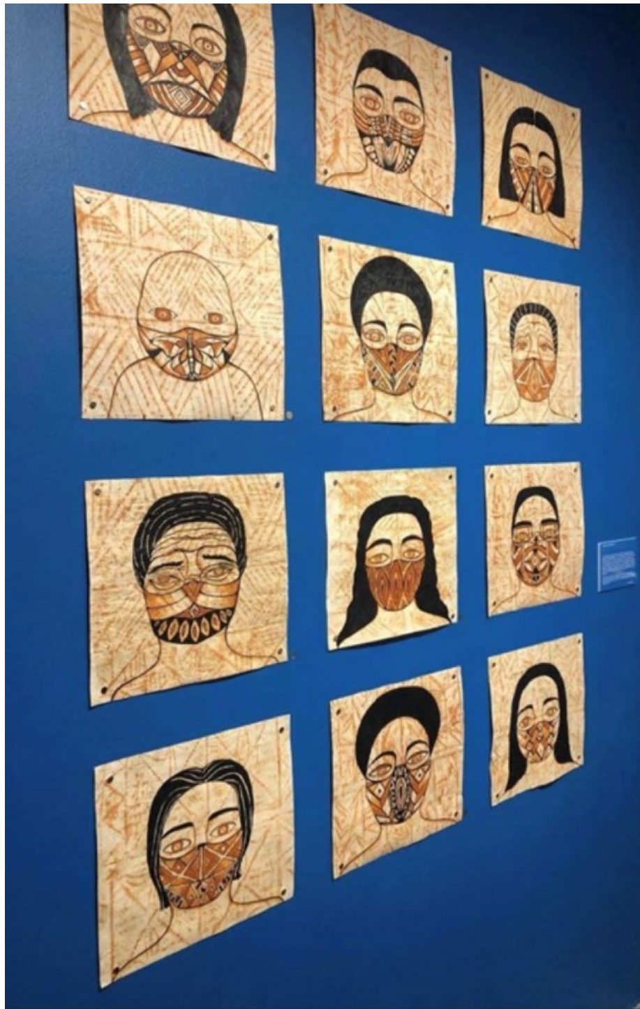
Figure 8 Faces of the Pandemic

Note: Faces of the Pandemic —a series of works by Tui Emma Gillies and Sulieti Fieme’a Burrows, painted in 2020 in response to the COVID-19 pandemic.