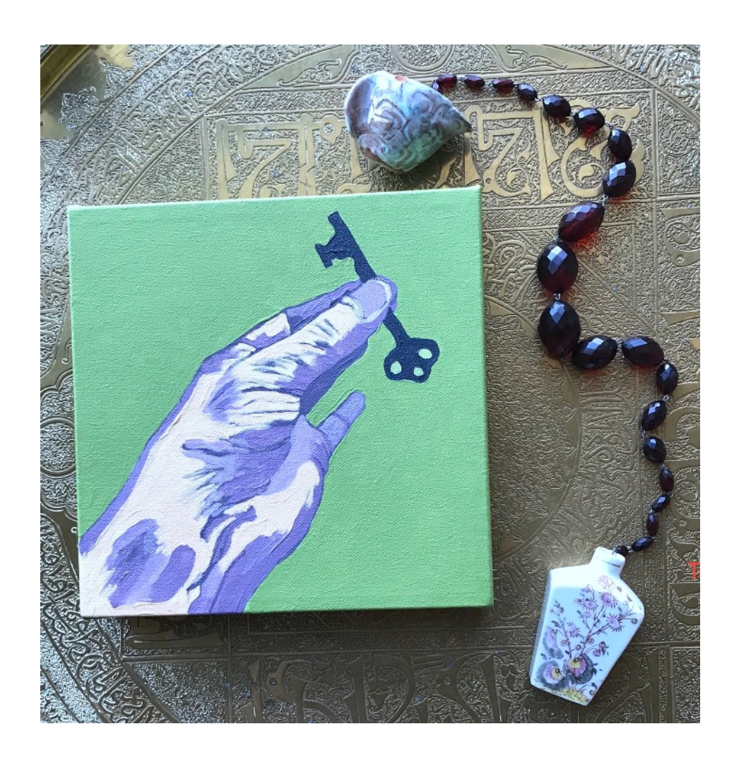
Figure 3 Long ago, lost and found mysteries (McLeod, 2020)

My self-portrait is an assemblage of several objects I value and love—things I've inherited, made, found, or purchased. These include an antique Indian table, a wee slightly chipped clay pitcher, a string of 1930's ruby-coloured beads, a miniature vase or medicine bottle, and a small painting of my hand holding an old-style key. On the brass table-top, the beads cascade from the pitcher down the side of the painting as if falling towards the vase. Completing the cyclic design, the hand offers the key upwards towards the pitcher.