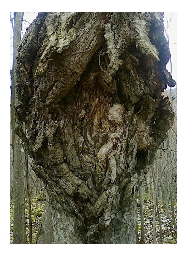
Figure 4 Dendro Series: On Burls