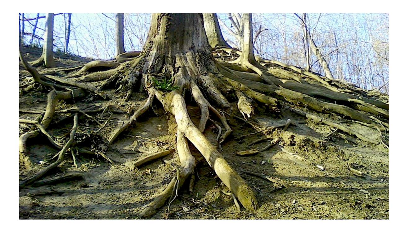
Figure 3 Dendro Series: Rizoma

This is an intricate and crucial question, I believe, and I am beckoned to explore it further. I respond by excavating another image.