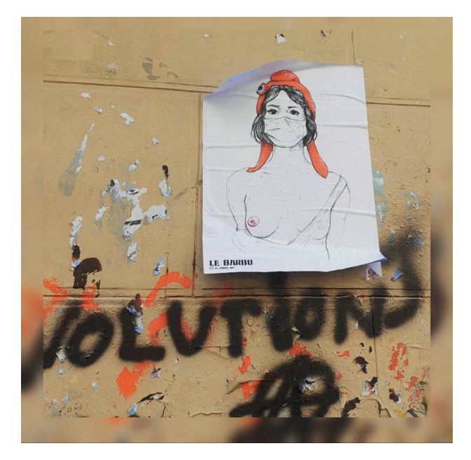
Illustration 1. "Phrygian bonnet, surgical mask."

As there is no useful way to define a " parisien " or a " montmartrois ," I do not use these denominations. My interlocutors and I shared the same space at a singular moment in which residents were essentially the only people in Paris (an unprecedented phenomenon in a city with approximately two million residents that is flooded daily by up to ten million people from the suburbs, in addition to tourists). I moved to Montmartre in 2016 and remained there throughout confinement. Emptied of outsiders and those who could escape their small apartments for the countryside, the social and physical proximity of Montmartre was amplified.