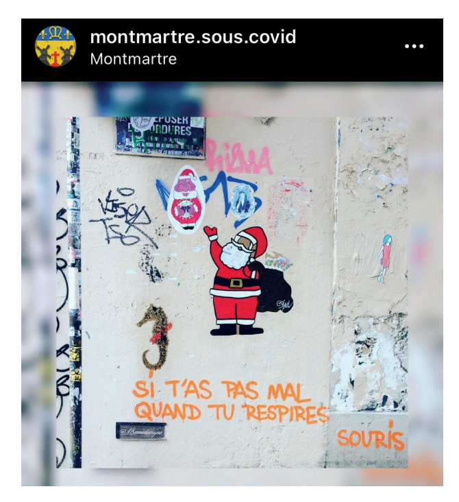
Illustration 2. "If it doesn't hurt when you breathe, smile."

Parisian outdoor culture. Given the price per square foot in Paris, Parisians spend their lives outdoors—exercising, eating, relaxing, reading, and protesting in the city's open spaces. Even when confined, the city's outdoor culture persisted.