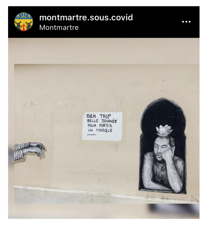
Illustration 4. "Far too nice a day to wear a mask."

beliefs, ideologies and precedents provide the theoretical system for understanding and responding to disease.