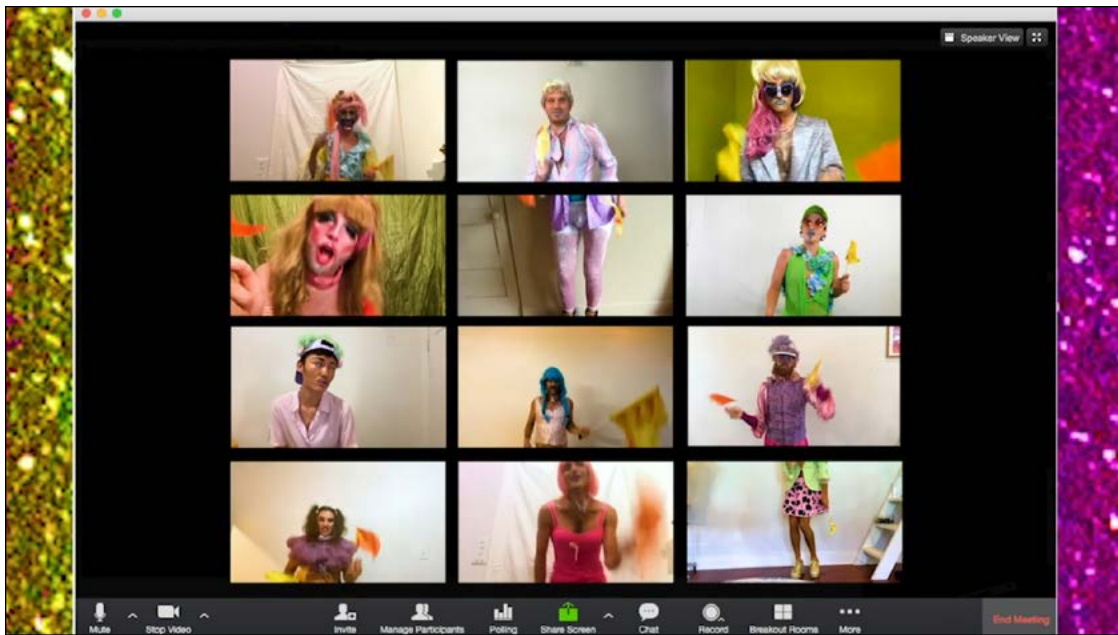
Figure 1: A screenshot of The Flaming Flagettes' virtual Easter parade video.

founded Krewe du Fool, which parades on April Fool's Day (1 April). They invited participants to send photos or videos of themselves dressed in their Fool's costume, which they compiled into a five-minute "virtual parade" framed by comical scenes of an impatient spectator ( https://youtu.be/-IrDnVpzrsA ). The final moments thank the participants and "most importantly" all kinds of frontline workers, ending with the message, "Stay home and save lives."