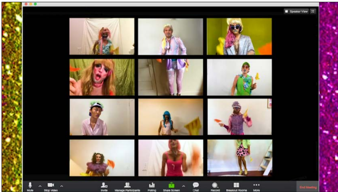
Figure 1: A screenshot of The Flaming Flagettes' virtual Easter parade video.

founded Krewe du Fool, which parades on April Fool's Day (1 April). They invited participants to send photos or videos of themselves dressed in their Fool's costume, which they compiled into a five-minute "virtual parade" framed by comical scenes of an impatient spectator ( https://youtu.be/-IrDnVpzrsA ). The final moments thank the participants and "most importantly" all kinds of frontline workers, ending with the message, "Stay home and save lives."