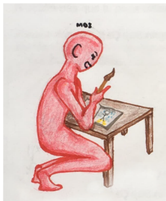
Figure 2. Tina drew a picture of herself journaling as one of the activities she enjoyed the most during the pandemic

One of our main lessons learned from using photo journals was the importance of prioritizing the process over the results. For some participants, the journaling project was an opportunity to learn about themselves, to develop a new skill, and to feel motivated during the pandemic (Figure 2).