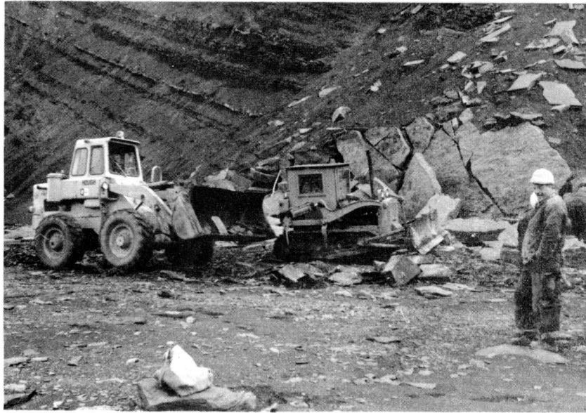
Figure 1. A bulldozer and payloader prepare to remove the track-bearing slabs (on right) from the bottom of the Joggins cliff.

The high tide stranded the party and the equipment for an hour or two, but this did not really interfere with the progress of the work, though this had to be completed in the glare of the vehicle headlights. The final procession of vehicles returning along the beach must have been an awesome sight to the inhabitants of Lower Cove.