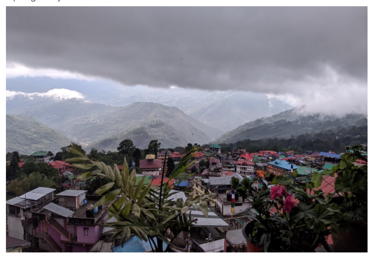
Figure 1 : My home. My Safe Space. My City. My Kalimpong in the middle of a storm. When I think of home, this is one of the image that comes to my mind. Somewhere lying in between is the change that is coming, but the mountain stands still, May 26, 2021.

Whenever anyone asked me, "where are you from?," I have proudly answered Kalimpong. Never any kind of hesitation. I didn't flinch, I didn't stutter; in other words, I didn't even have to think twice. Kalimpong was home and had always been a safe place (Figure 1). A place that welcomed everybody. So why do I feel the need to write this letter to you? I am still trying to understand this question. And as I write this letter, I hope the meanderings of my brain become more evident, and you and I both get a sense of why I felt the need to do so. While writing this letter, I hope that this letter reaches you in the Universe and that somehow I receive your blessing. What do they call it these days? Manifesting, I guess. So I manifest Kalimpong that you will hear me.