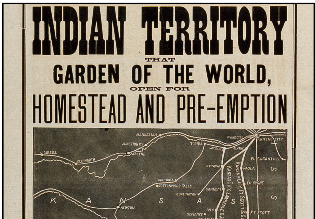
Figure 1. Poster advertising land in current-day Oklahoma. Records of US Army Continental Commands. Record Group 393. NAID 4662607. 1989[ca. 1880].

enabled homestead, preemption, and land title, that the US was able to legally extend its jurisdiction into these western Indigenous lands. It is because these lineages of land title exist, post “discovery” claims, that land-as-property maintains its value and place under US property law. In other words, this is a key aspect of how US colonialism is maintained. Figure 1 below is an 1889 poster run by Kansas City, Lawrence and Southern Railroad Co., advertising Indian Territory as a “garden of the world,” open for “homestead and pre-emption.” 2