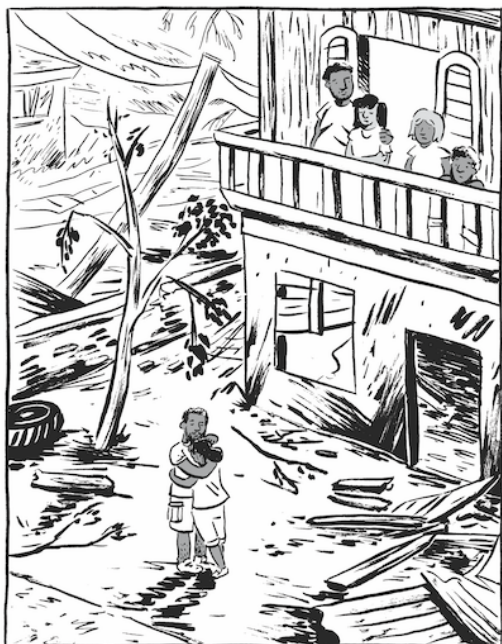
Figure 4. After Maria comic

Similarly, in Everyday Austerity , the story of Sharon and Bill offers an insight into everyday ways of getting by during hardship and personal crises. The example in Figure 5 below illustrates how their Saturday morning routines help them to keep going, made up of simple pleasures-making a cooked breakfast, going to local shops, petting dogs and feeding horses, having a walk, a tipple of beer, and doing the crossword-that they look forward to. Accompanied by a short excerpt or vignette – as a means of rich yet specific story-telling – the imagery of the two participants displays a physical sense of ease and togetherness. This is portrayed by their close corporeality, relaxed posture and eyes both on the crossword puzzle as a shared, enjoyable activity. Furthermore, the choice of typeface is an important one, again selected in dialogue with Claire. Given that the excerpts were often taken from field diaries, sometimes verbatim, and that the zine tells very personal stories of living with austerity, it was agreed that the typeface needed to convey this. Claire suggested using one that she had designed from her own handwriting, to give a sense of a handwritten note or diary entry.