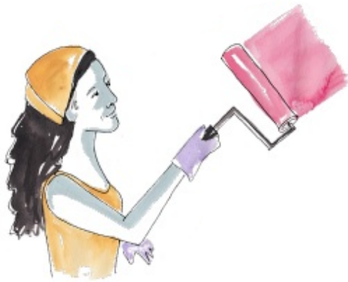
Figure 8. Depicting race: Selma in the Everyday Austerity zine

However, we were careful not to romanticise families' 'resilience', and place too much emphasis on capacities at the household level. Overly focusing on the capabilities of families as the analytical explanation for impacts and recovery from societal hazards moves responsibility for risk towards affected populations, whilst the broader political, economic, social, and environmental structures that shape family resilience are obscured and left unexplored. One of the ways we did this was to ensure that any details about the research and findings are kept slimmed down, placing the focus instead on the stories as placed together, rather than our own academic interpretations. In the Everyday Austerity zine the inside sleeve of the card cover contained a very short introduction and similarly in After Maria there was a very brief introduction, plus 6 pages with information about 'Disasters around the world'.