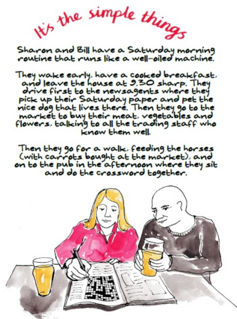
Figure 5. 'It's the simple things', from the Everyday Austerity zine

Visual storytelling also allows researchers to be economical with text in a way that maintains the complexity of findings (Aiello and Parry 2019). A researcher may need 500 words to communicate an idea that can be communicated in a few images, with limited dialogue (Public Anthropologists 2020). Therefore, it is critical to collaborate with an experienced artist who is sensitive to the research findings and also has the skill and intuition to distil ideas into images. Artists require sufficient freedom so they can effectively communicate the ideas presented, meaning researchers must forego some control over the outputs if they are to fully embrace the visual narrative form of comics and zines.