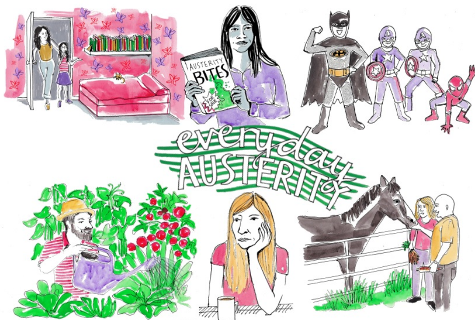
Figure 3. The central image of the Everyday Austerity zine, when folded out

Furthermore, comics and zines have their own vocabulary: gutters, panels, tiers, balloons, bubbles, bleeds, splashes, perspectives, shading, folds, pleats and so forth. These are all elements that carry meaning and which exist meaningfully in relation to one another in the space on the page. Contemporary comics and zines ask us to reconsider several dominant commonplaces about images, including that visuality stands for a second-tier literacy. Notwithstanding, comics and zines involve a substantial degree of reader participation to decode narrative meaning and sometimes subtle imagery. And the visual content of comics and zines that once signaled a "lesser-than" literacy is now an integral part of contemporary daily lives. Primary media intake, especially online, combines the verbal and the visual and often with complexity people learn to navigate quickly (Hattwig et al 2013).