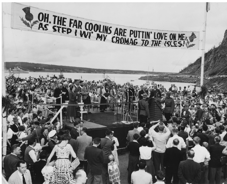
Figure 4: Premier Henry Hicks and the assembled crowd look on as C.D. Howe uses an ancient Scottish claymore (two-edged broadsword) to cut the Nova Scotian tartan ribbon. The claymore is said to have been at the Battle of Culloden in 1746. See The Canso Crossing's History and Impact: Gut of Canso Museum and Archives, http://www.virtualmuseum.ca/pm.php?id=record_detail&fl=0&lg=English&ex=00000222 (accessed 8 April 08).

ceremony to capture prime locations to witness the event. 41 Thousands of copies of the Official Souvenir Program , along with Lawrence Doucet's commemorative pamphlet, The Road to the Isle , were produced for distribution to attendees.