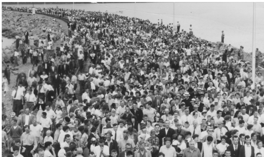
Figure 5: The 100 pipers were followed by the official party and a huge crowd. It is estimated that more than half of the approximately 40,000 people in attendance took the opportunity to cross the causeway that day. This ceremony would be repeated, virtually unchanged, at both the 25th and 50th anniversary celebrations. This and several other photos from 13 August all emphasize the enormous crowds that flocked to the opening, many of them crossing the new causeway on foot. See The Canso Crossing's History and Impact: Gut of Canso Museum and Archives , http://www.virtualmuseum.ca/pm.php?id=record_detail&fl=0&lg=English&ex=00000222 (accessed 8 April 08).

systematically portrayed as such in official publications as belonging to a culture and society inherently different from other North American places. This concept of another time and place was packaged and sold, McKay argues, along with the province's natural landscapes and seacoasts, as the basis of a comprehensive tourism strategy. This antimodern idea was embraced by "middle class cultural producers" and "created through framing and distilling procedures carried out in thought, and then set into practice through processes of selection and invention." 48 Under Angus L.'s watchful eye, Nova Scotia, rechristened as a "New World Scotland," would soon come to sell his version of Cape Breton as a tourism destination like no other. It was convenient that the island, much like Scotland, could be divided into a "Lowland" industrial core, with the ravages of industrialization, class conflict, and the curse of urbanization, and a more pristine "Highland" area consecrated with a national park and surrounded by the rural remnants of a Scottish diaspora, which had populated the area earlier in the 19th century. It would take some time for this trope to be fully realized, but its pursuit would