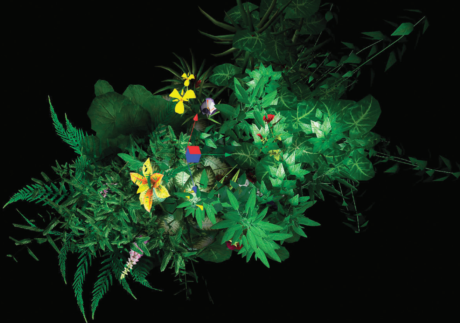
Rick Silva, still from Render Garden , 2014. Realtime 3D application.

It depends. We don't really work with artworks that are very technologically focused per se. Our artists use digital technology as part of their cultural background, so the equipment they use is what anyone might use every day. We usually need flat screens, sometimes computer screens or tablets, but since our main focus is the physical instantiation much of the work we show in our gallery is in more traditional formats: prints, sculpture, assemblage, and so on.