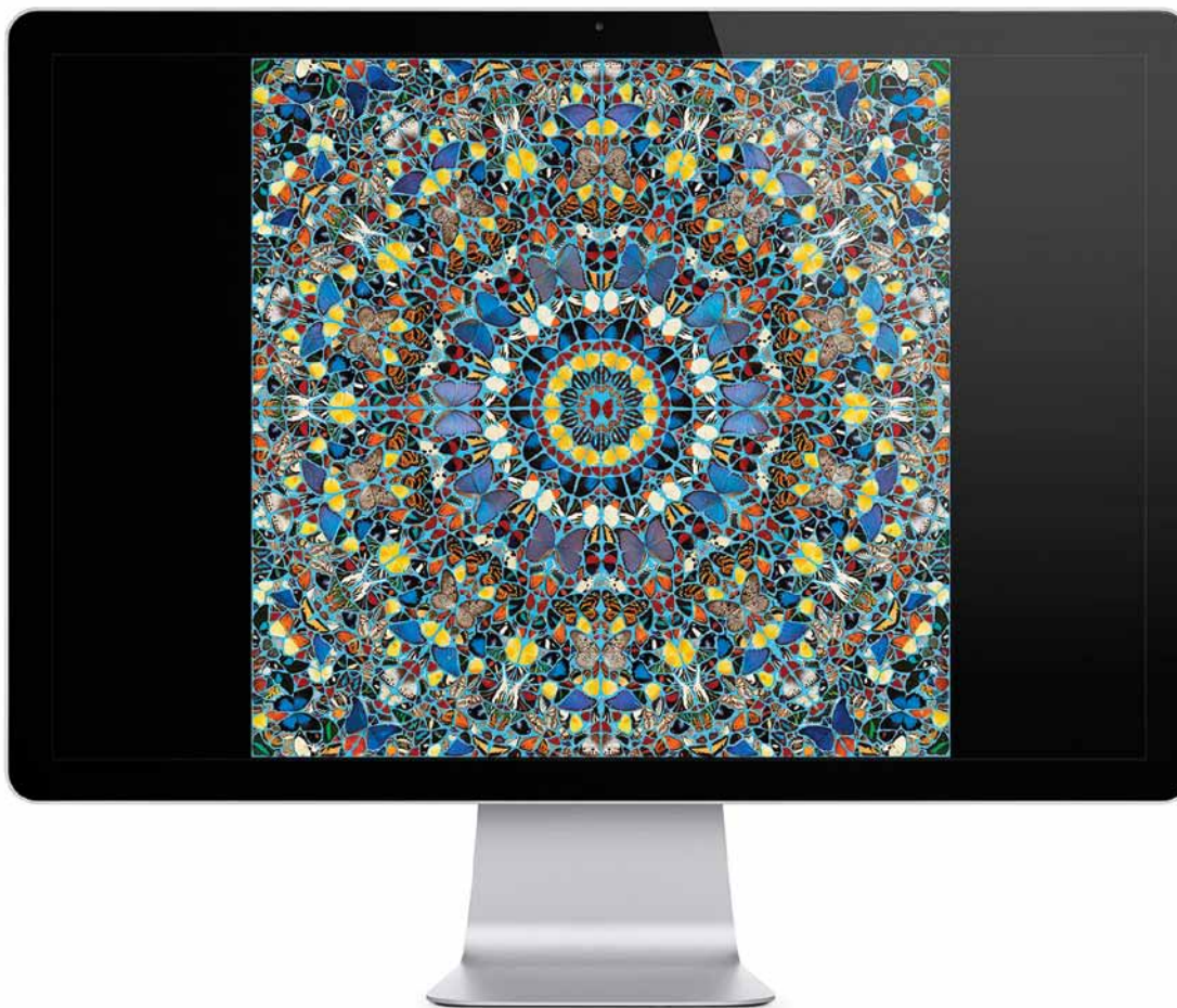
Damien Hirst, Idolatry , displayed on iMac.

the new focus of his collection, and it is displayed on screens in the hotel rooms. But to do this, the hotel pays a yearly subscription fee.