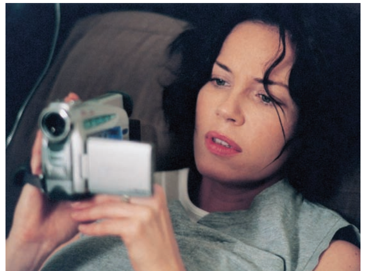
Connie Nielsen as Diane de Monx in Olivier Assayas, Demonlover, 2002.