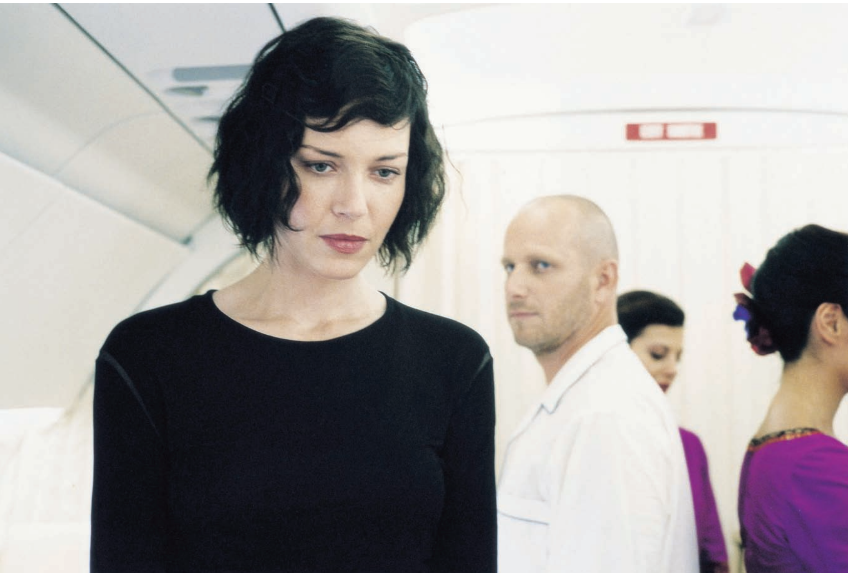
Connie Nielsen as Diane de Monx and Charles Berling as Hervé le Millinec in Olivier Assayas, Demonlover, 2002.