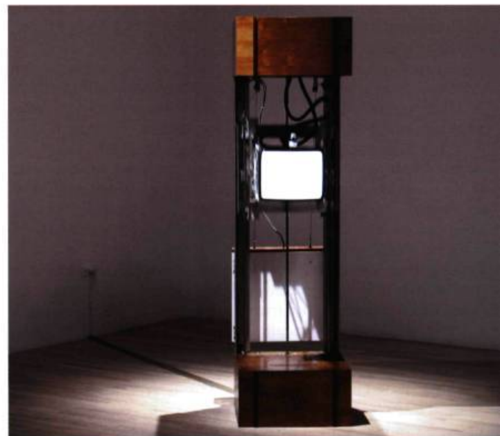
Sofian Audry, Jonathan Villeneuve, sound concept: Myriam Bessette, electronic concept: Samuel St-Aubin, Trace V , 2007. CRT screen, mechanical lever, wood, aluminium, electric wires, audio amplifier, microcontroller, RF converter, computer; 76, 2 x 50, 8 x 190, 5 cm.