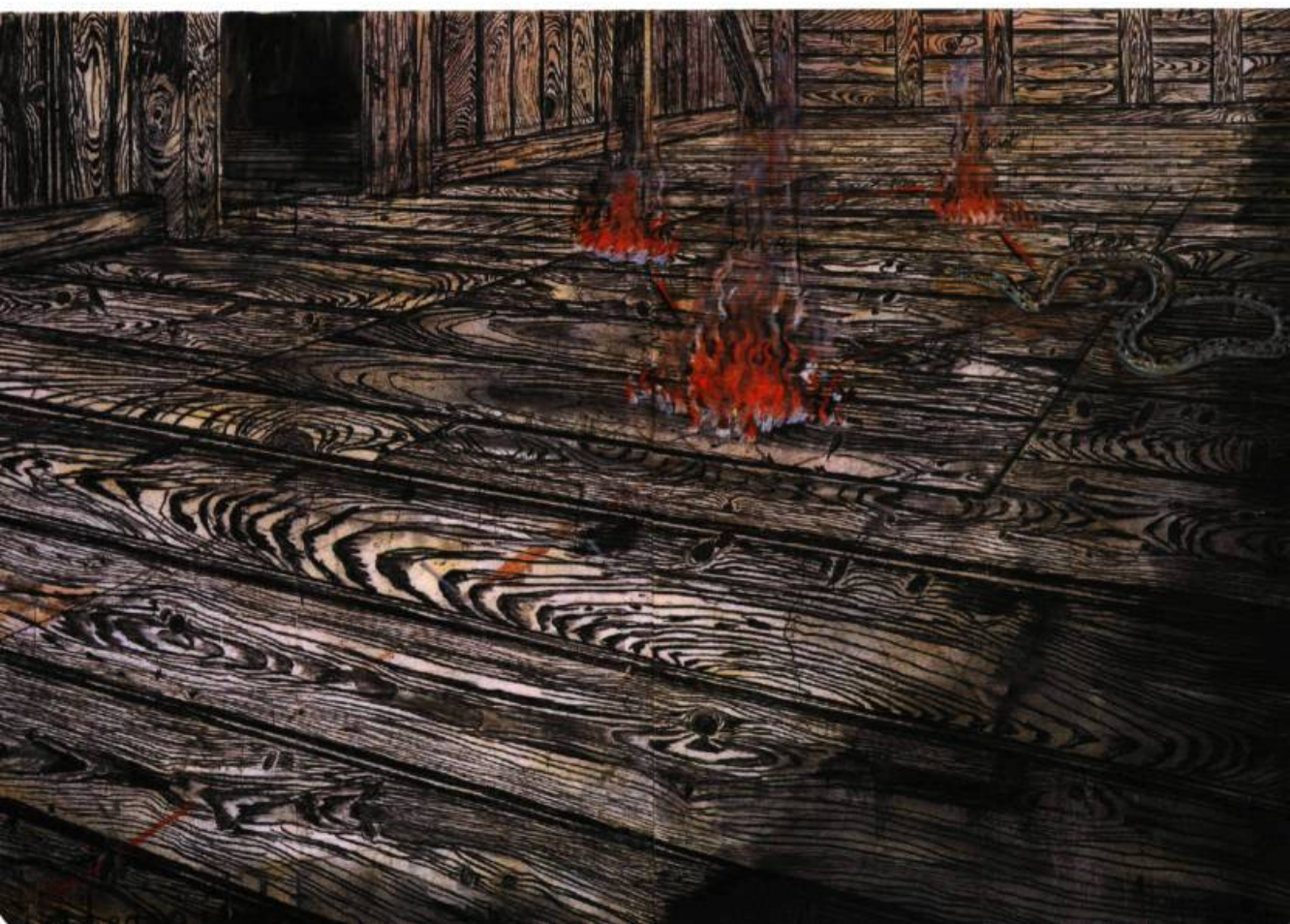
Anselm Kiefer, Quaternité , 1973. Huile, fusain sur toile de jute; 298, 4 x 432, 4. Coll. Musée d'art Moderne de Fort Worth.