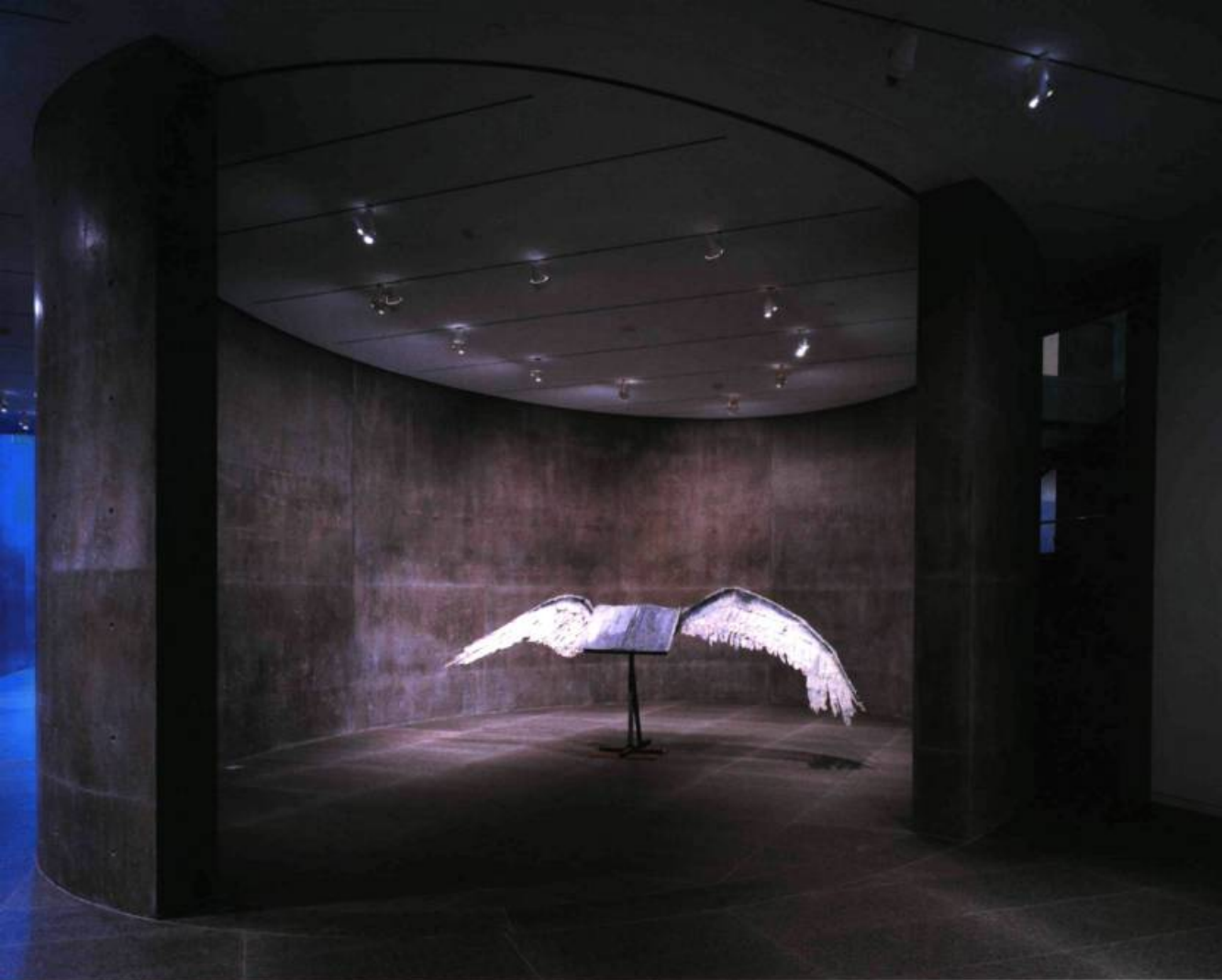
Anselm Kiefer, Livre avec ailes , 1992-1994. Plomb, acier et étain; 189, 9 x 529, 9 x 110, 2 cm. Coll. Musée d'art Moderne de Fort Worth.