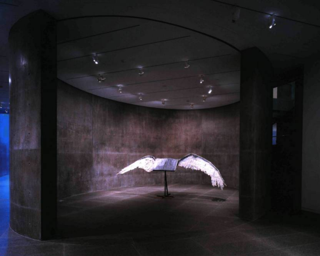
Anselm Kiefer, Livre avec ailes , 1992-1994. Plomb, acier et étain; 189, 9 x 529, 9 x 110, 2 cm. Coll. Musée d'art Moderne de Fort Worth.