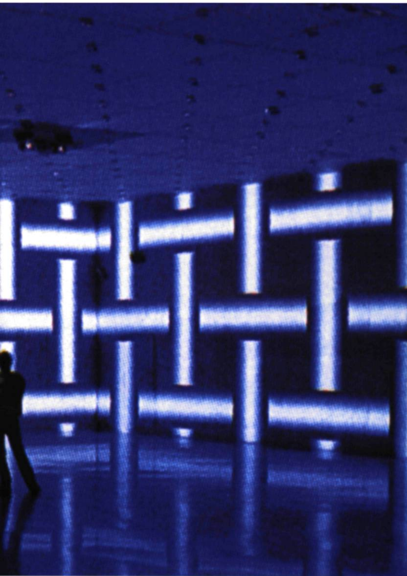
Peter Kogler, Untitled Installation , 2002. DVD sound track projection.