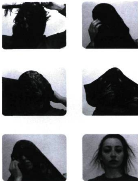
Adriana Czernin, Entanglement , 2002. Video projection, played on two monitors.