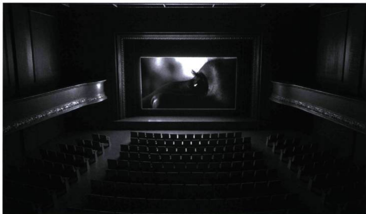
Janet Cardiff & George Bures Miller, The Paradise Institute , 2001. Canadian Pavilion, 49 th Venice Biennial.