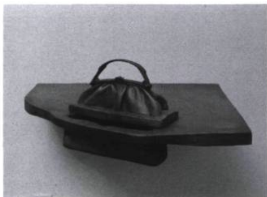
Celine Surprenant, Untitled (Handbag) , 1988. Mixed-media; 185 x 132 x 30,4 cm

In this exhibition, a handbag, belt, scrub brush and valise are but some of the objects that re-enter with an immediate visual recognition, but an altered perception of their purposes. There is immediate evidence of careful selection since, although these items are not of an intensely personal nature, the references are significant in terms of general purpose. The handbag traditionally holds one's money, cosmetics and various papers; the belt