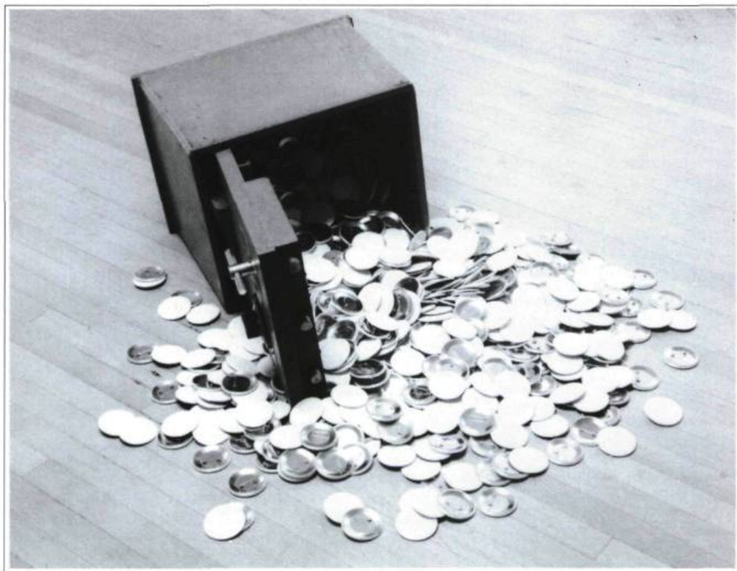
Kursten Mosher, Campaign , 1989, mixed media; 20 x 40 in

B.D.: Galleries are free, but you don't see many casual visitors coming in, because they're not of that world. They don't hear about it.