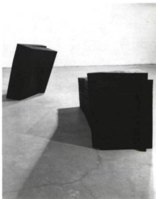
Roland Poulin, Le temps ralenti (à Hélène) , 1987.

lations of excitations and disrupt the equilibrium of the organism. So, too, Poulin, confounds our first expectations of unity and completion; thematizing ruptures and discontinuities as component elements are frozen, apart, in their very horizontal disparity and contiguity. This thwarted conjunction of signs lends the work its forcible sense of fragmentation.