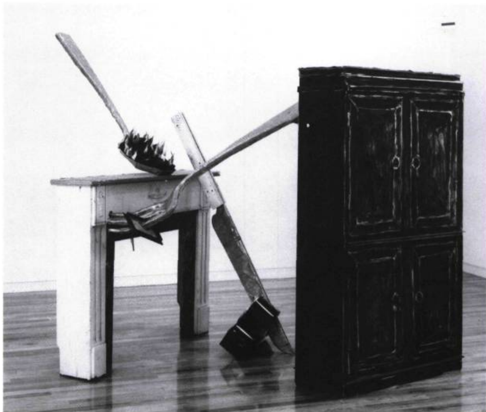
Bill Woodrow, Empty Grate , 1987. Wood, aluminium duct, enamel and acrylic; 81 x 86 x 80 in.