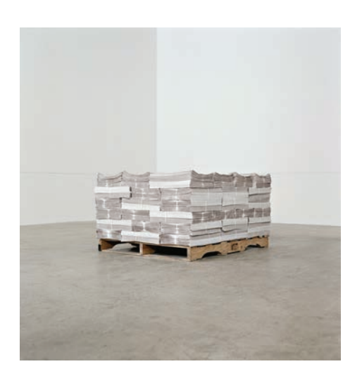
Thérèse Mastroiacovo, Situation : Auto Duration . The pile of publications at the beginning of the exhibition in Gallery 1 at CLARK. Situation : Day 01.