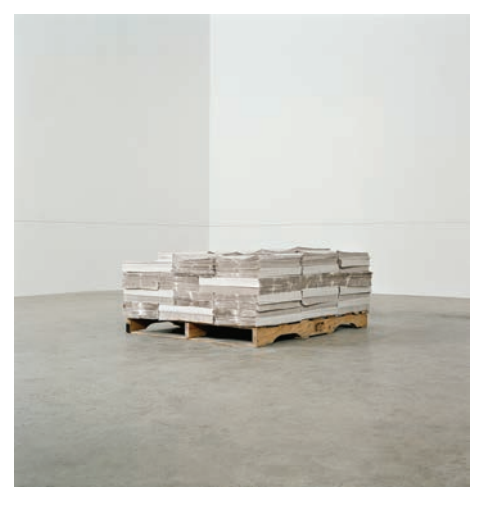
Thérèse Mastroiacovo, Situation: Auto Duration. The pile of publications at the end of the exhibition in Gallery 1, before it was re-stacked in New Location (after the Audio Station and before Gallery 1). Situation: Day 31.

The tradition of artist publications emerged out of a desire to break away from the confines of the gallery structure, which conventionally was more conducive to housing objects rather than ideas. This was especially the case at the beginning stages of conceptualism, wherein the artist publication became a distinct site of opposition and as such was rooted during this time in the evolving idea of the alternative space. Ed Ruscha's famous 1963 artist book, Twenty-six Gasoline Stations, can be sited as an example of this particular type of program. Ruscha's book is a photographic record of all the gas stations he would pass in his frequent travel between two cities. Twenty-six Gasoline Stations presents a collection of systematically captured black and white photographs of the same quotidian subject in gradual flux. To utilize the printed page as an alternative exhibition space and to then disseminate it as an object was a subversive gesture. Mastroiacovo's publication is similar; however, she takes this gesture one step further by bringing the space of the publication back into the space that it may