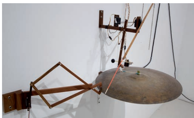
Jean-Pierre Gauthier, installation views, Orchestre à géométrie variable , Galerie B-312, Montréal, 2014.