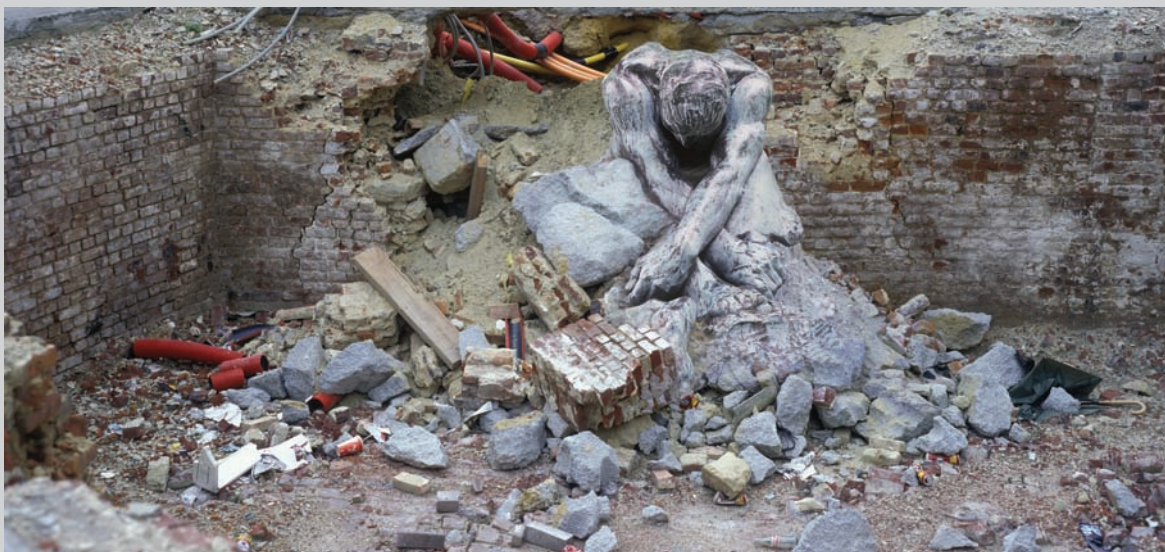
Isabelle Hayeur, Monument aux bâtisseurs de ville (Ou monument « X ») , 2008, impression au jet d'encre sur polyester laminé, 76 x 163 cm

Il faut mettre dans la même catégorie de déréliction la série des images photographiques de la ville de Québec. C'est une histoire moins récente qui s'y affiche et le traitement photographique qu'impose Isabelle Hayeur aux images numériques permet une plus grande audace. Mais les balafres et événements que l'on voit ne sont pas seulement le fait de l'ar-