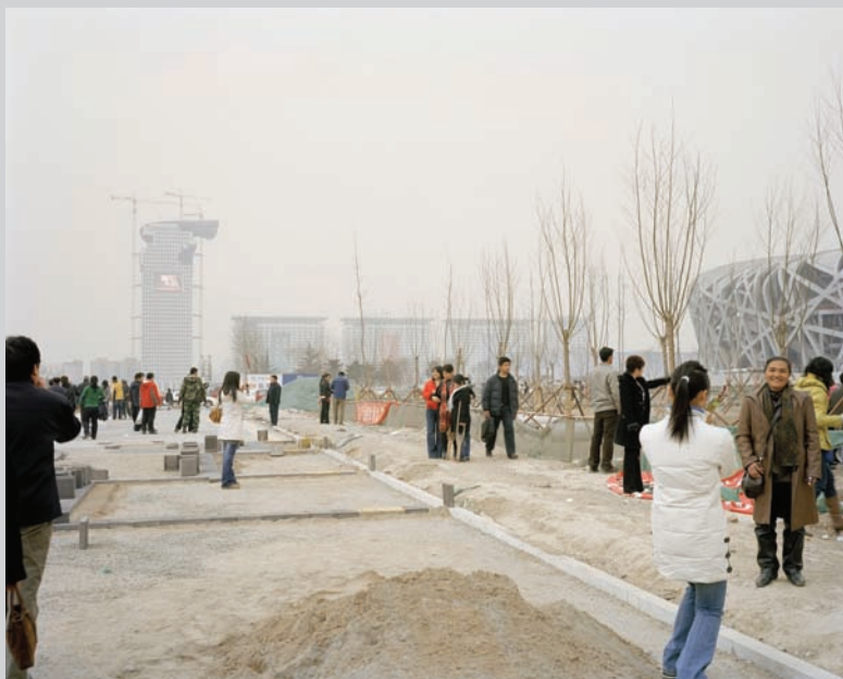
Raymonde April, Équivalences (detail), 2009, c-print, 99 x 123 cm

always evokes something numinous before and after those facts, however quotidian and unprepossessing they seem to be. She tackles a latent semiotic plenum that informs the fabric of a commonly experienced world, whether in family, inhabited spaces, or quirky souvenirs of the everyday.