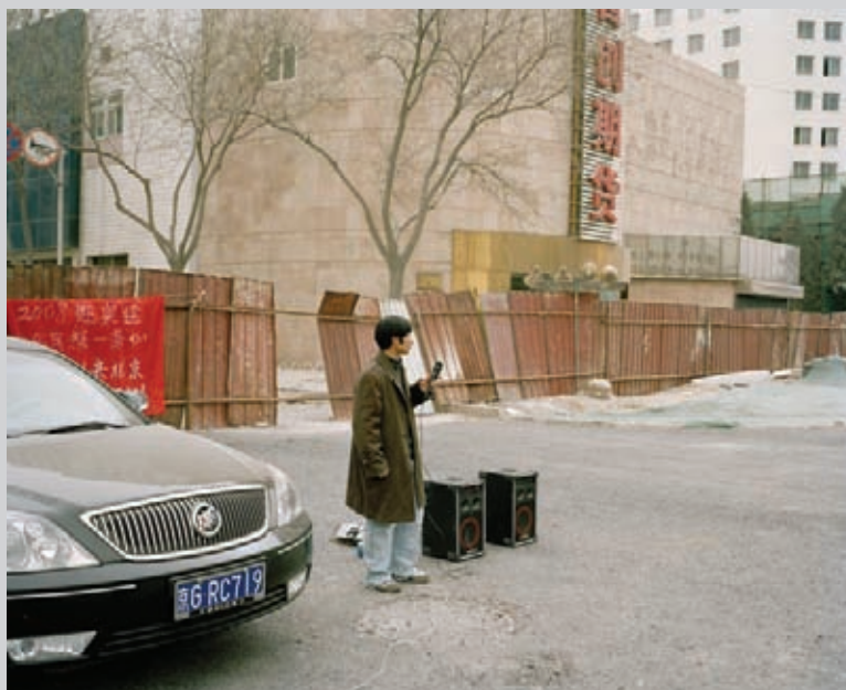
Raymonde April, Équivalences (detail) , 2009, c-print, 99 x 123 cm

If April's work is a touchstone for interpreters and art lovers like myself, it is because her photographs are clearly the work of a poet who openly embraces the world of everyday life. A poet who, instead of being carried away by hurly-burly cinematic effects and hyperbole, keeps her ear pressed close to the chest of human subjects – and the landscape as lived – so as to hear the resilient and never-boring beating of a human heart. In her overwhelmingly porous art, binary sets of seemingly opposed traits and values – an always-