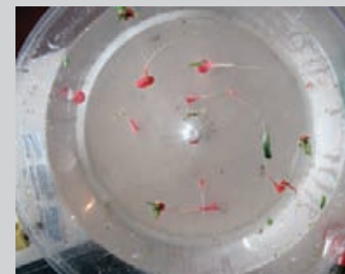
Raymonde April, Équivalences (detail) , 2009, c-print, 76 x 102 cm

The distance between Personnages au Lac Bleu , her first installation, and the works shown at Galeries Donald Brown, Les Territoires, and Occurrence, is historically daunting but decidedly redeemed by her devotion and integrity and the sheer cohesiveness of her creative vision. She has always remained true to her own maverick