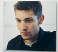
Absence , exhibition view, Patrick Mikhail Gallery, 2018, c-prints, 2001, 75 × 75 cm

impacts of such large-scale networks and infrastructures. In Absence , first presented in 2002 in Montreal in the show La vie en temps réel: Mode accéléré and subsequently exhibited in France, Germany, and Switzerland, he examines the multifarious impacts – affective, attentional, onerous – of early computing and digitization on human labour. Landing Sites , a new multimedia work, is focused on transatlantic fibre-optic cables and the ways in which they have reconfigured the temporalities of human communication and information transfer.