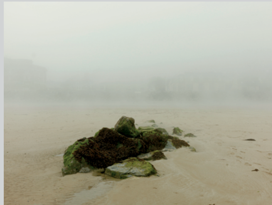
Landing Site (East) , c-print, 2018, 122 × 162 cm