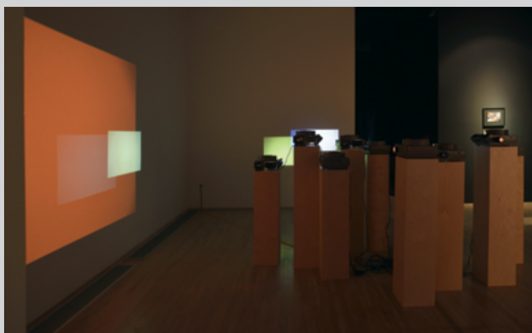
Croisements, 2014, 9 projecteurs diapositive, socles, 720 diapositives, dimensions variables