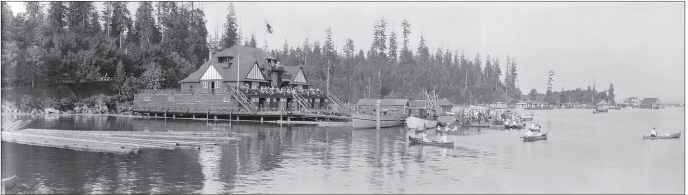
Figure 2: Vancouver Yacht Club (left), Vancouver Arena (right) on Burrard Inlet, 1913.

If economic prosperity is to accompany a sport facility, there must be new consumer spending. In other words, consumers should not merely shift their leisure choices from other local businesses to the sport facility and its surrounding businesses. Scholars label such a phenomenon the substitution effect. If consumers from town decide to go to a hockey game instead of the theatre, there will be no actual economic growth or benefit to the city, since this expenditure is already going into the local economy. Moreover, new jobs created by the sport facility are balanced by the loss of jobs in businesses in other parts of town if consumers merely substitute one form of spending by another. On the other hand, economic growth can occur if the sport facility draws out-of-town patrons who do not normally spend their discretionary income in this locale. Similarly, real economic growth can accrue if local consumers decide to spend their money at the sport facility instead of outside the region. Under either or both of these conditions, money previously not spent in town would constitute new spending and represent real growth. 17