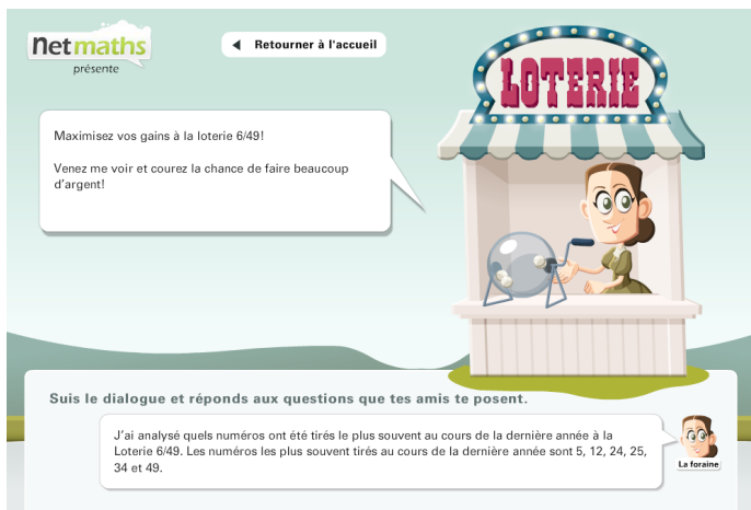
FIGURE 2. Lottery 6/49 home page

created in line with the Quebec mathematics curriculum were pertinent to the New Brunswick context, but with minor modifications. The tools could help students create links among different subject areas and also between different branches (domains) in mathematics. The teachers' concerns were mainly related to the use of the virtual tools in supporting students to develop their mathematical competencies and about the cross-curricular competencies – both envisioned by the provincial curriculum. Beyond the learning outcomes specific to the mathematics curriculum, teachers said that the simulators could help students develop their critical thinking toward games of chance and gambling, which according to them, is an important aspect of cross-curricular learning. The resources concerning virtual simulations enabled students to gain a sense of probability scenarios without engaging in actual gambling. Figure 2 presents the Lottery 6/49 home page, where students were asked to play and test some ideas.