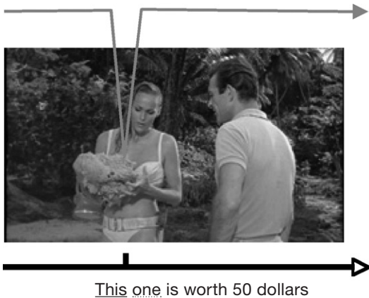
Figure 1: The integration of visual and verbal information in a film text

This kind of relationship between visual and verbal information in film can be accounted for as “visual-verbal cohesion,” i.e., one linguistic/visual element is necessary for the interpretation of another from the other mode. 3