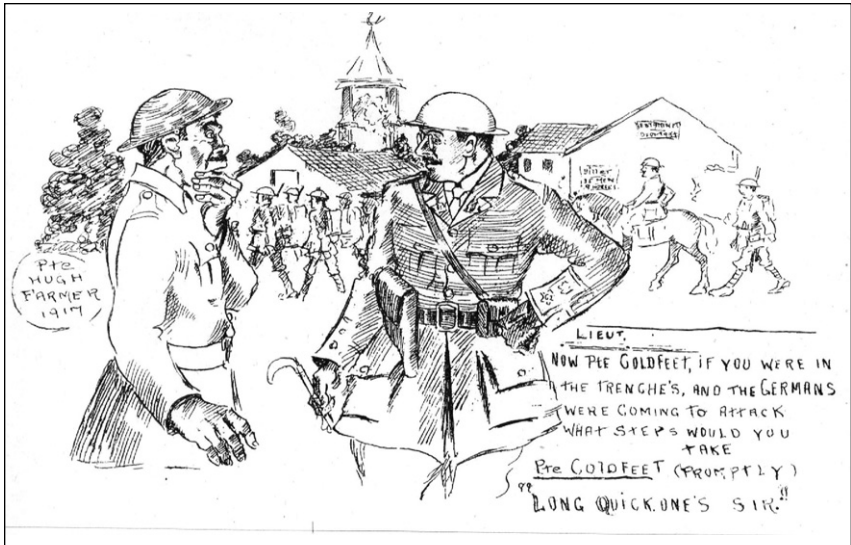
Private Cold feet

“Long quick one’s [sic] sir.” 52 To those not a part of the soldiers’ culture, anti-heroic actions, gallows humour, and biting satire were sometimes misconstrued as soldiers looking to abandon the war effort. Had the army been reduced to cowards? Had rot set in to the once proud fighting forces? While it might have been true for some soldiers close to succumbing to the stress of combat, most understood their role in the war and were not anxious to leave their mates in the lurch. Anti-heroes helped the soldiers deal with the strain engendered by the boredom, banality, and brutality of trench warfare. These cultural figures were also a reflection of inner anxieties and deep-set wishes, which were not always acted upon, but provided a vicarious outlet for many of the expressions and actions prevalent among most soldiers at the front. One should be wary of unifying themes in cultural history; the messiness and inconsistencies of conflicting issues need to be acknowledged and teased out. Soldiers could despise civilians one day and write pining letters to loved ones at home the next; they could turn their nose down at the “eye wash” emanating from ultra-patriotic papers and then turn to those same newspapers to understand what was happening at the front; they could be dodging shells one minute and then, after clearing the wreckage of a trench or helping a bloodied companion to the rear, return to collect the same shell bits as trophies or souvenirs. Heroes could be