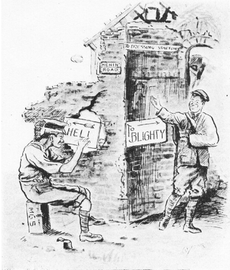
THE WRITING ON THE WALL.

The Writing on the Wall