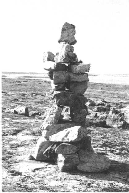
Figure 1. Close up of traditional inuksuk, near Puvirnituk, Nunavik.