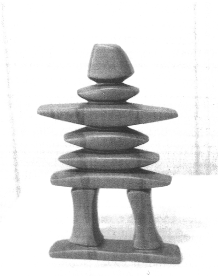
Figure 2. One piece inuksuk model.