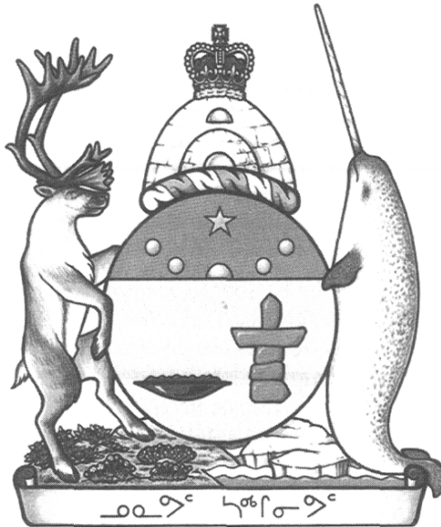
Figure 4. Nunavut's coat of arms.