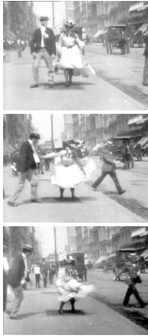
Figure 8. Thomas A. Edison, Inc., “ What Happened on Twenty-third Street, New York City ” (1901).

and street traffic before the actors—a man in summer clothes and a woman wearing an ankle-length dress—enter and walk toward the camera. They pause as they cross a grate on the pavement and the escaping air blows the woman’s dress up to her knees (figure 8). 21