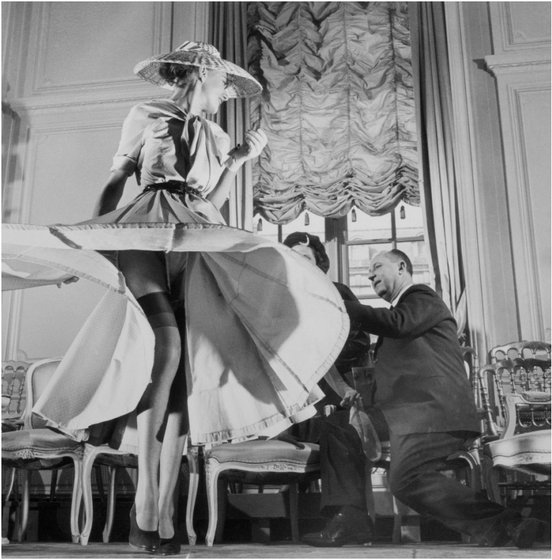
Figure 3. Christian Dior with Woman Modeling Dress and Stockings (11 March 1948). U864177ACMEI RMI

Stockings were highlighted for the first time when Christian Dior, noted French designer, exhibited his French collection. The hose, which either continued the dress' color scheme from hem to ankles or afforded a direct contrast, ranged in shades from tender peach to ink black. The colors are called "Boulevard Banquet." Here a model swirls the skirt of a light blue crêpe dress to feature the sheer navy blue stockings.