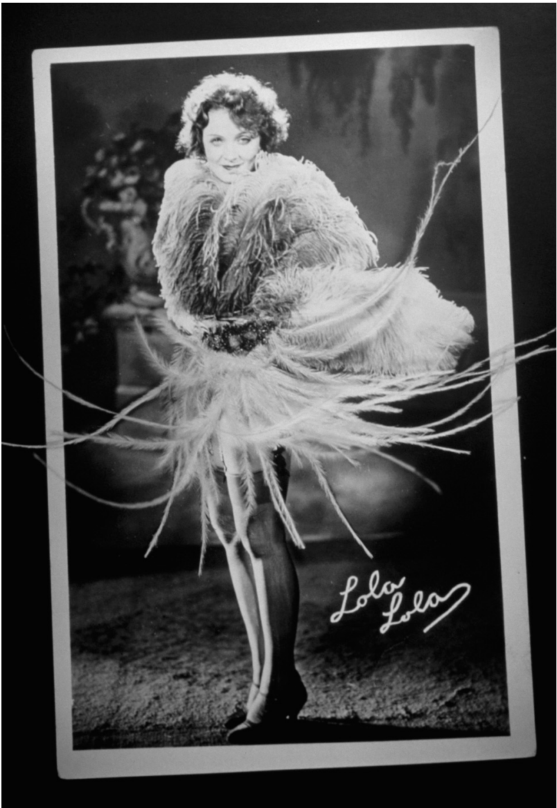
Figure 6. Marlene Dietrich as Lola Lola in “Der Blaue Engel,” postcard from Marlene Dietrich’s personal effects (1930). 0000289437-028 RM

could see how she was made [my italics].” 15 Such cards may themselves be linked to the tradition of photographic flick books, Mutoscopes and Kinoras, mechanized forms of which