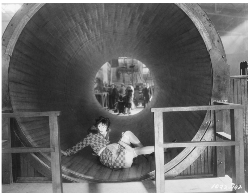
Figure 7. Clara Bow in "IT" (1927). JS1567841 © John Springer Collection/CORBIS

this short film, which lasts a little over a minute, is summarized in a contemporary Edison catalogue: