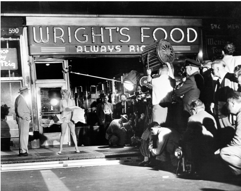
Figure 1. Marilyn Monroe and Tom Ewell Filming "The Seven Year Itch" (16 September 1954). U1264471INP RM © Bettmann/CORBIS

The type of full skirt worn by Monroe was first introduced in February 1948 by the French couturier Christian Dior (figure 3) as a reaction against the austerity of war-time patterns. The extravagant skirts of Dior's "Carolle Line" (from "corolla" mean-