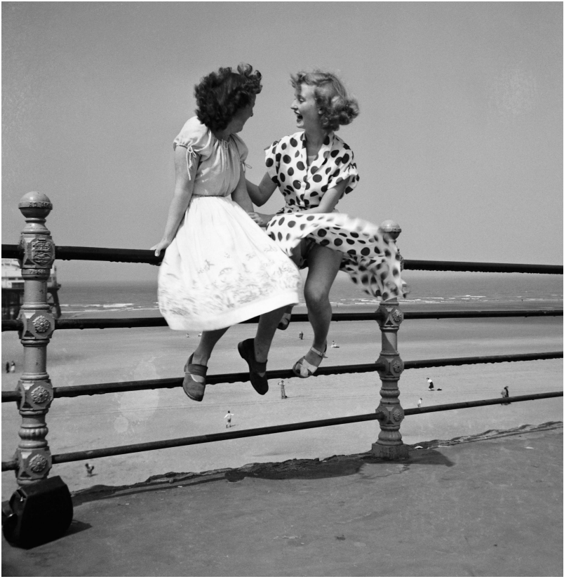
Figure 11. Bert Hardy, Maidens in Waiting , silverprint (July 1951). HU022100 RM