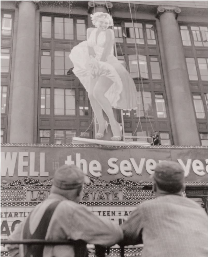
Figure 4. Fifty-Two Foot Figure of Marilyn Monroe Installed at Loew's State Theater, New York (19 May 1955) . U1084468 RM

These images of Marilyn Monroe with her dress billowing around her immediately acquired iconic status and have inspired many adaptations and variations in the fifty years since they were taken.