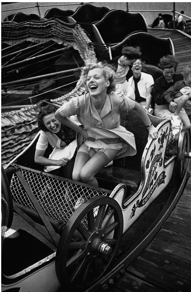
Figure 10. Kurt Hutton, Young Women at a Fair , silverprint (1938). HU010261 RM

or at a fair, in high spirits and among friends. There is evidently an element of the ritual of courtship in this voluntary exposure.