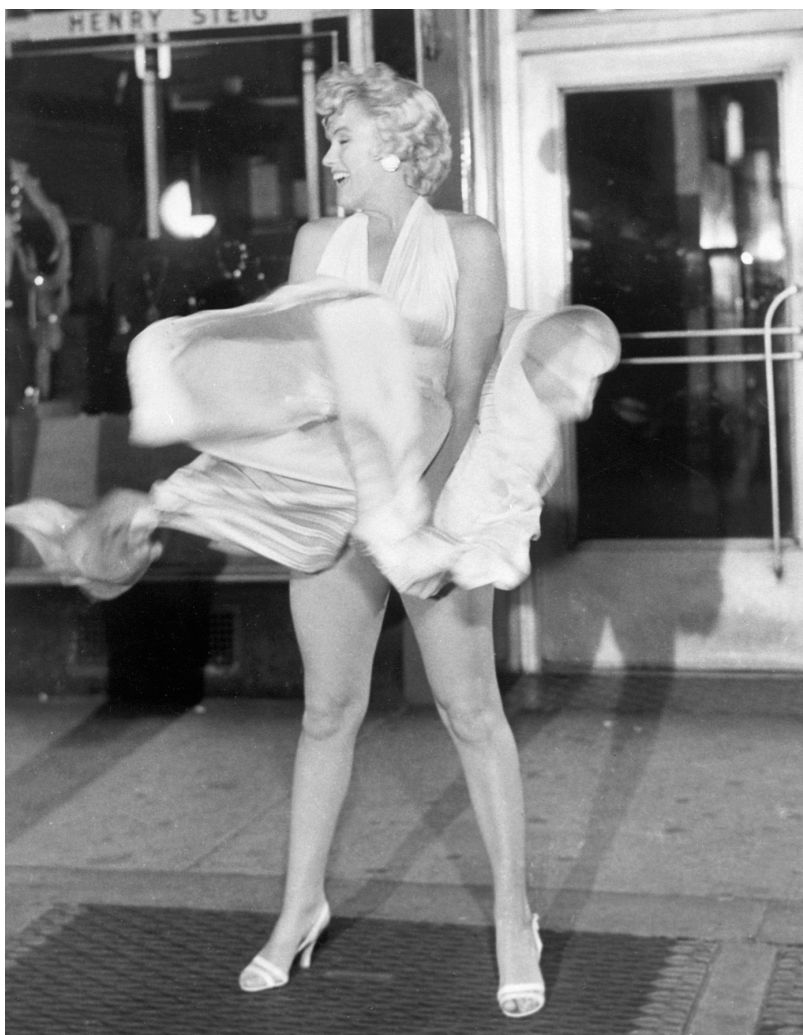
Figure 2. Marilyn Monroe on Subway Grating for “The Seven Year Itch” (16 September 1954). BE037457 RM

ing “the petals of a flower, typically forming a whorl enclosing [appropriately] the sexual organs”) required as much as twelve metres of material and were meant to be worn with matching or contrasting sheer stockings in order to create a style that was at once elegant, feminine and provocative. The original caption to the photograph reproduced here explained: