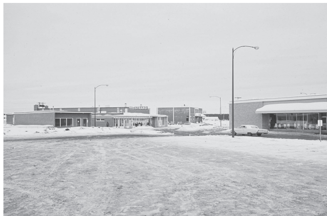
Figure 4. Thompson’s main commercial section in 1966 showing the Strand Theatre in the centre and the Hudson’s Bay Store on the right.