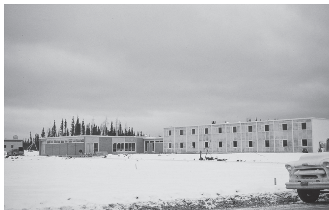
Figure 2. The Thompson Inn in 1958. This establishment was the first commercial hotel and a favourite gathering place for locals and miners.

resident administrator zealously removed women who attempted to enter the camp, and even when families began to arrive in Thompson proper he met all incoming women “to check their credentials” and removed any women he deemed to be of questionable morality. Unlike developments further south, the gender imbalance was acute. Even at the end of 1959 the number women in the community remained well below fifty, and concerns about their safety were paramount in the minds of local planners. Any whiff of scandal could have damaged the emerging town’s plan to attract more nuclear families. 15