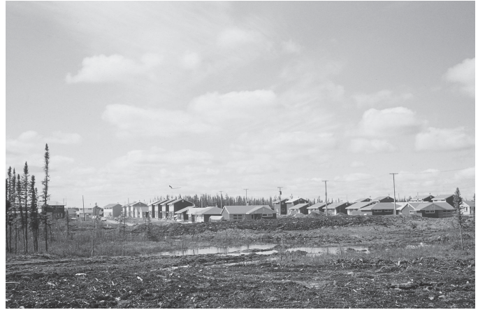
Figure 3. The Juniper subdivision under construction, 1958.

The pervasive emphasis on "modern" permeated most media discussion in both the Thompson Citizen and the Nickel