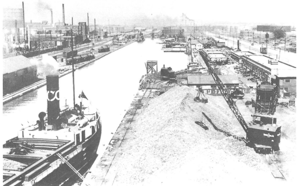
The same view on 2 June 1930, showing the development of industries including bulk fuel companies, particularly coal and oil refining, along both sides of the Keating Channel and well into the industrial district to the south.

THCA, Arthur Beales Collection, PC 1/1/335